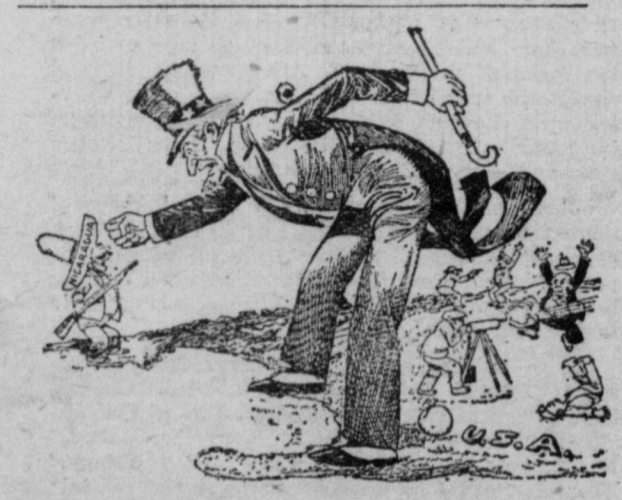
Hew Dare You Endanger Our Lives and Property.

There is much speculation in foreign as well as