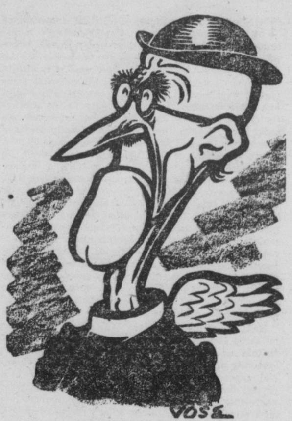
Joy Flees With Sin.

He attempts to prove God's existence by the facts that a watch must have a maker, a cathedral a builder. He says "is it any the less revolting to the intelligence to stand out under the stars and believe that they gathered themselves out of the vapors, that they determined their courses, settled the cycle of the seasons and are spinning away in