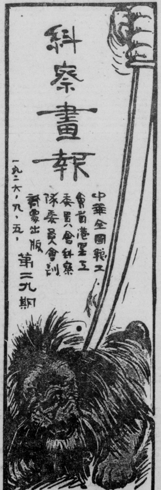
A Chinese Anti-British Poster.

It had been decided at the First Congress to convene the Second Congress at Hankow on May 1st, 1923. But on February 7th, occurred the massacre in Hankow of the railway union leaders and others by Wu Pei-fu, and white terror reigned throughout China. This massacre and repression was planned and ordered by British imperialists, who were financing Wu Pei-fu. The immediate occasion for it was the creation of the General Union of Railwaymen on the Peking-Hankow line; Wu Pei-fu dissolved the union, whereupon a general strike broke out,