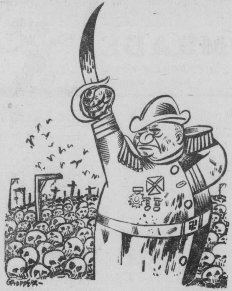
Hail Caesar, Napoleon, Mussolini-the Conqueror!