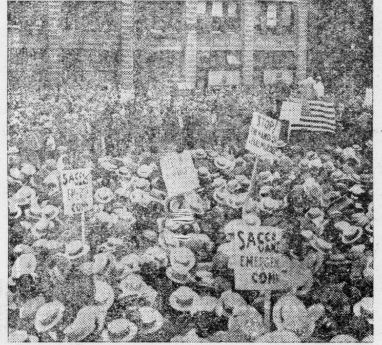
50,000 workers crowd Union Square to demand freedom for Sacco and Vanzetti—in the face of machine guns, armored motorcycles, gas and tear bombs, and 2,000 cops.