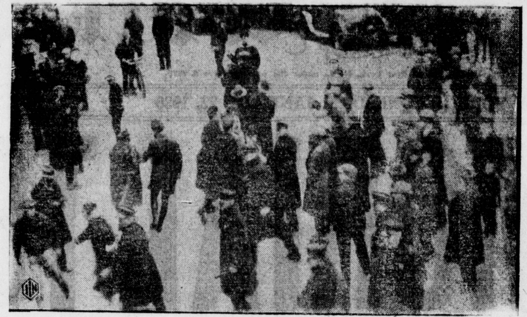
Six thousand textile workers fought police who tried to break up their demonstration at Dartmouth Mill. Photo shows the workers fighting the police.