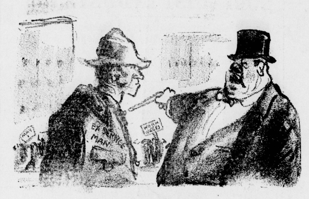
Gowan and Sock Your Enemy!"