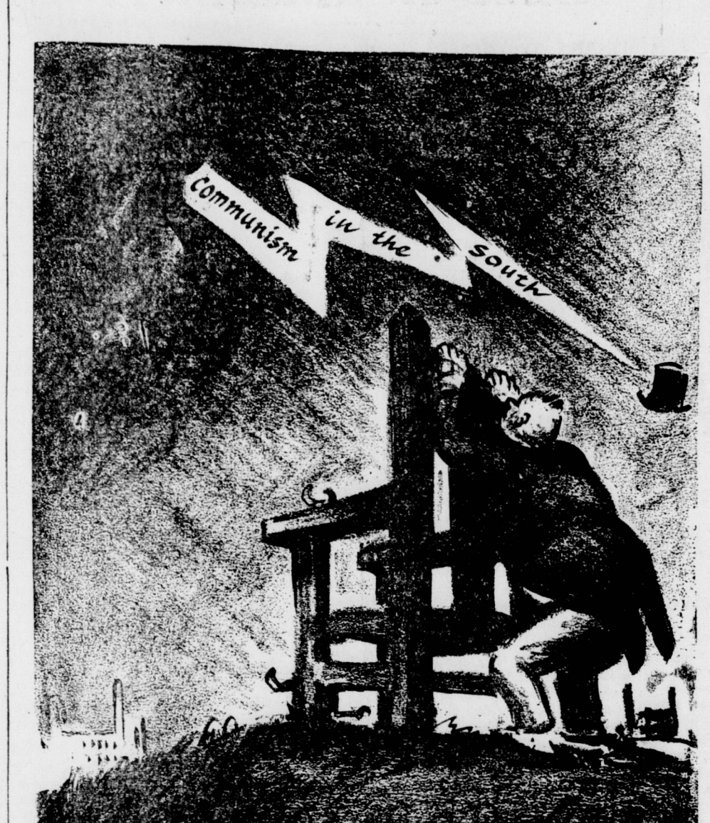
The attempt to legally murder Powers and Carr.