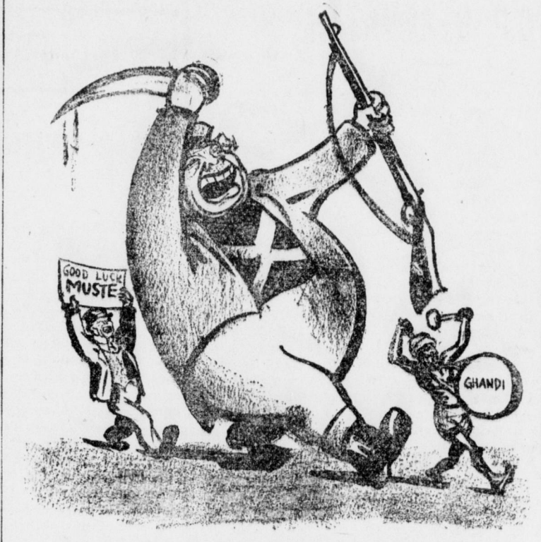
Each in his own way opposes the Indian revolution. Gandhi aids the British with pacifism and Muste aids Gandhi.