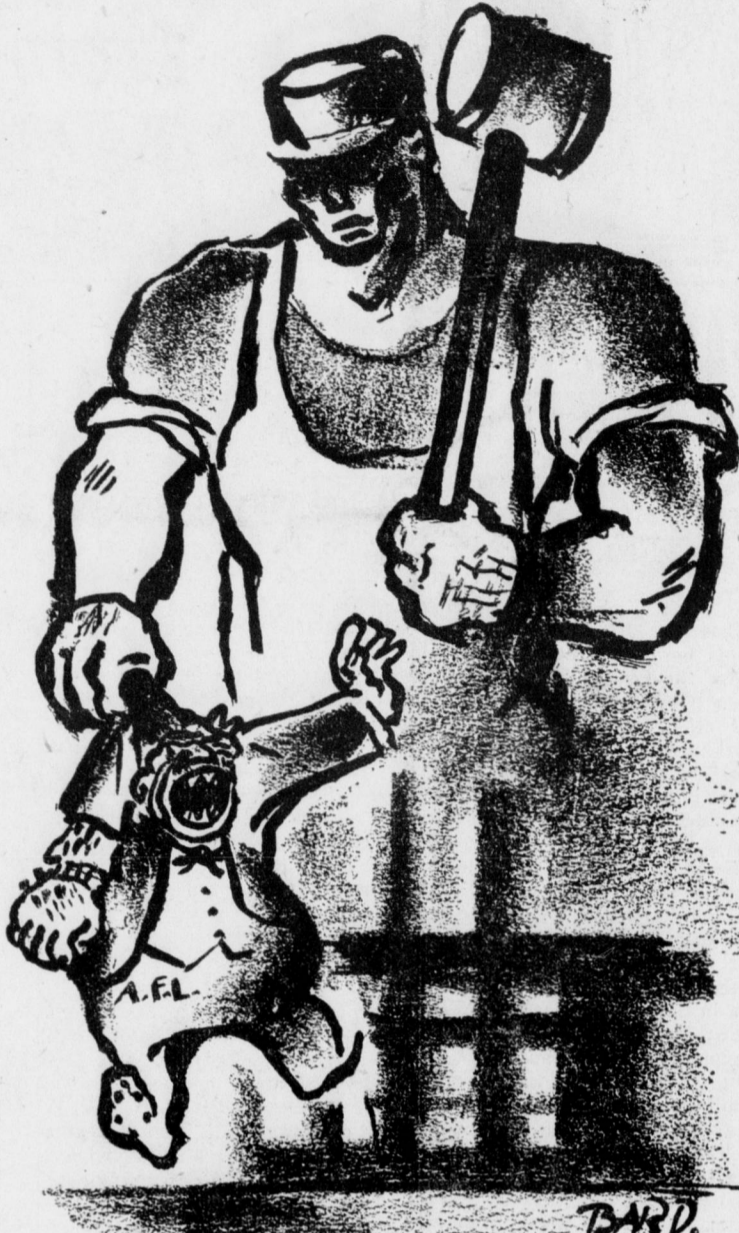
Smash the Fascist Lieutenants of the Bosses! By BARD

The enthusiasm and optimism displayed here is beyond description. One sees it everywhere in the shops, in the clubs, in the street, in short everywhere. In substance, the prevailing sentiment may