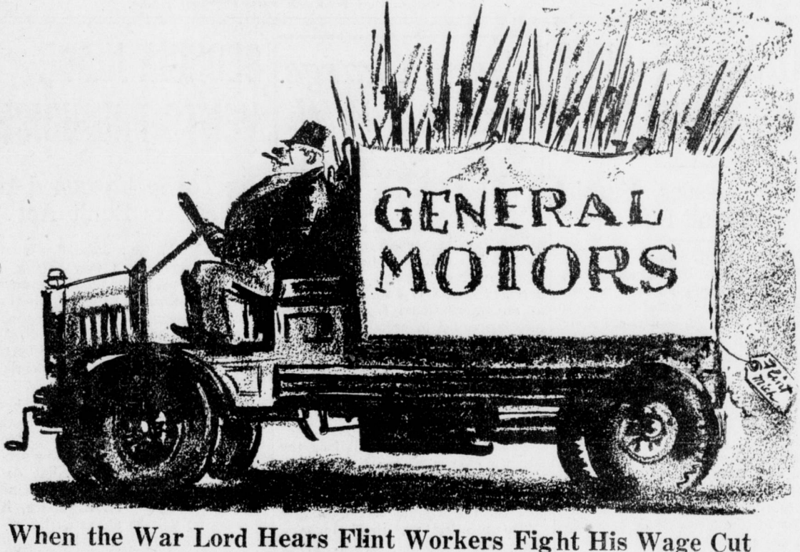
When the War Lord Hears Flint Workers Fight His Wage Cut

'Red drive" of his own. The Auto Workers' Union today and to stand fast for the strikers' County. own demands: recognition of the women, with a minimum daily wage named Jim Ayres.