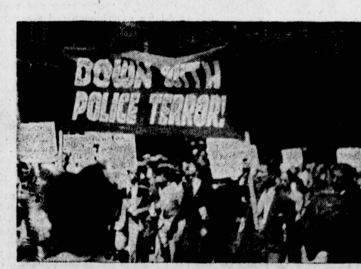
(Left): One view of the tremendous procession. (Above): One of the numerous placards carried in the demonstration. (Right): Negro and white workers carried this placard as thousands of Negro workers weighed the deminstration.