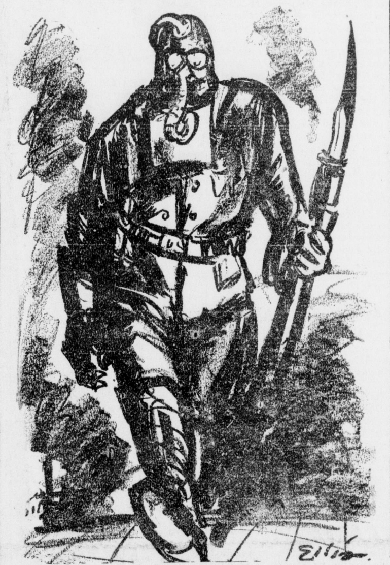
Demonstrate, Fight Imperialist War August 1.

MINOT, N. D.—Terrific hot Legge keeps on talking about the tional Industrial Conference Board weather is ruining the crops in this necessity of gettind rid of the surstandard study states. Railroads average 64 here west to Havre, Montana, the wheat. But the farmer, of course, must be fooled some.