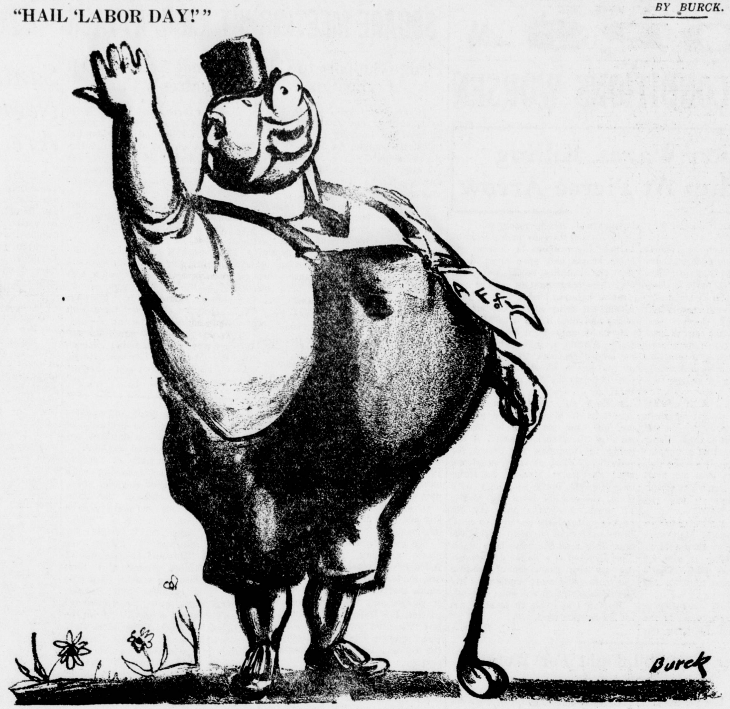
While Green sports in capitalist golf links in a game of class collaboration, the masses of starving workers mobilize to make Labor Day the Day of the Unemployed. Rally to the class unions of the Trade Union Unity League; form councils of the unemployed; fight for unemployed insurance and immediate relief!