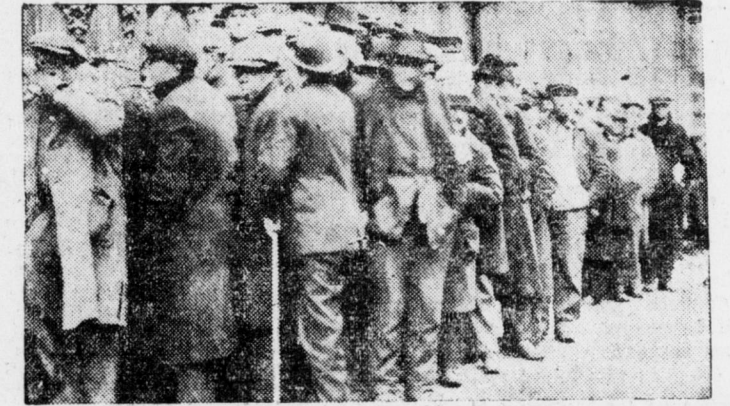
Hunger lines in capitalist America. And the bosses still have the brass to boast about the "superiority" of the capitalist starvation systems over the Soviet system of workers' rule!

"Sixty-day," "return to prosperity." Hoover has become an object of scorn. The employers, alarmed at the militant demonstrations of the unem-