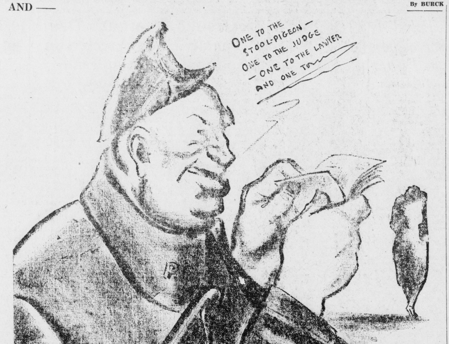
News item:-New York police and judges, now being "investigated," are running a brisk trade framing innocent young working women on charges of prostitution and forcing them to pay heavy graft in order to keep out of jail.

that effect by the Plenum of the E.C.C.I.