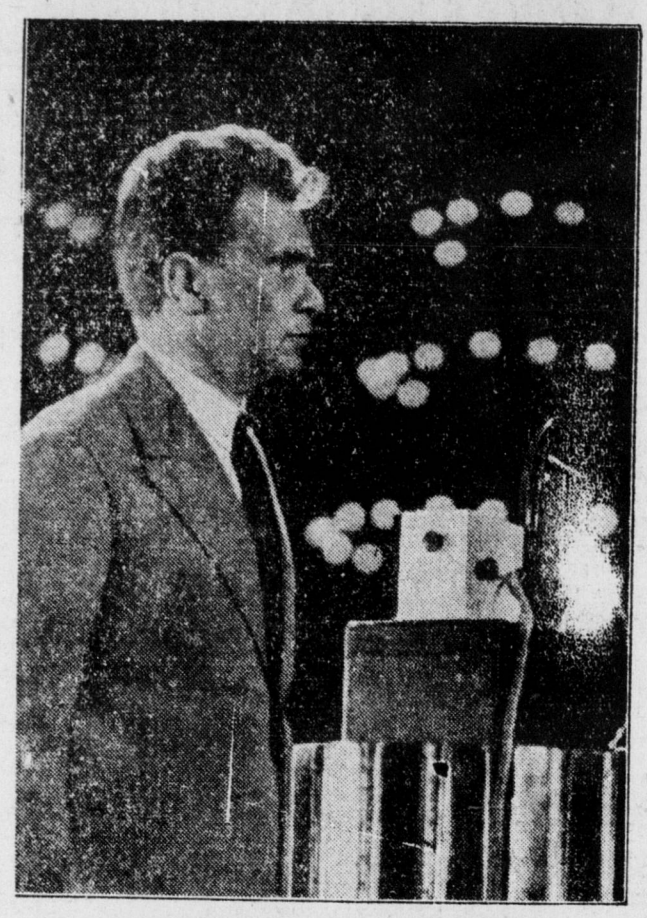
Leonid Ramzin, one of the chief conspirators in the interventionist plot against the Soviet Union, testifying at the trial of the wreckers,