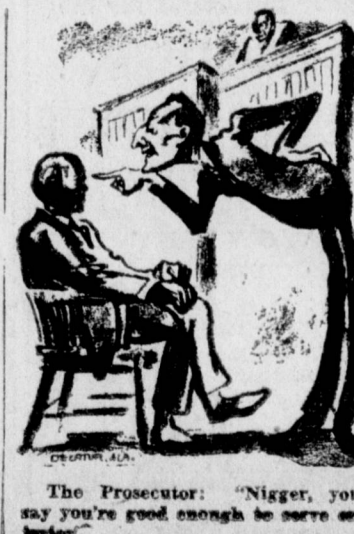
The Prosecutor: "Nigger, you say you're good enough to serve on a jury."

SEND MATERIAL FOR WAR ANNIVERSARY EDITION Marine, steel, auto, coal as well as workers in other industries should send material for the special issue of the Daily Worker for the anniversary of the United States entry into the world war, which will appear on Saturday, April 8. Veterans and those at present in the armed forces are also urged to write. All material must be in by April 4. District and local Daily Worker agents should send in orders for this special edition immediately.