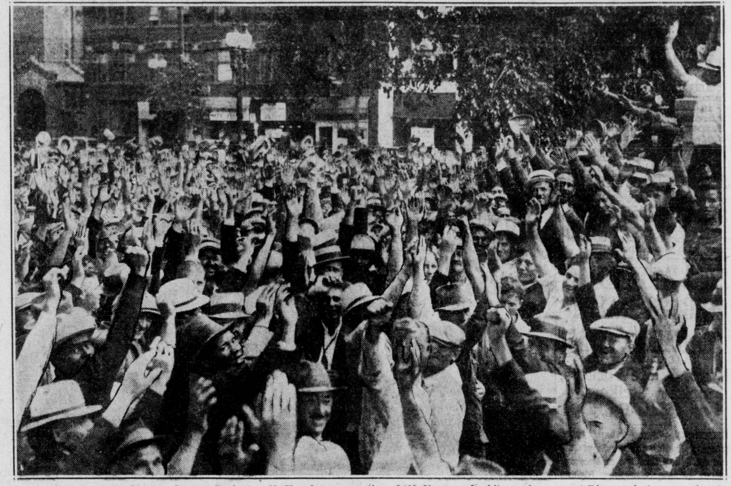
Gathered in Washington Square, Rochester, N. Y., where more than 6,000 Negro and white workers are striking against wage cuts on city and country relief projects, this group of strikers pledged themselves to carry on the struggle until their demands are granted.