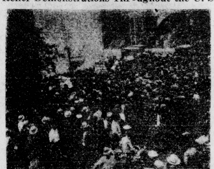
Demonstrations for immediate relief like the one pictured above tool place in scores of cities throughout the United States yesterday.

BREAD PRICE Tammany Pledge No Relief Demonstrations Throughout the U. S.