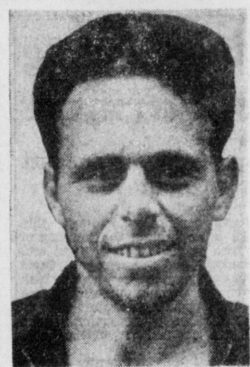
Baltimore Local