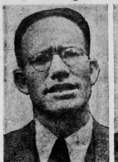
Sec'y of Philadelphia Local

Seamen and Longshoremen Delegates At the 2nd National Convention of the Marine Workers Industrial Union