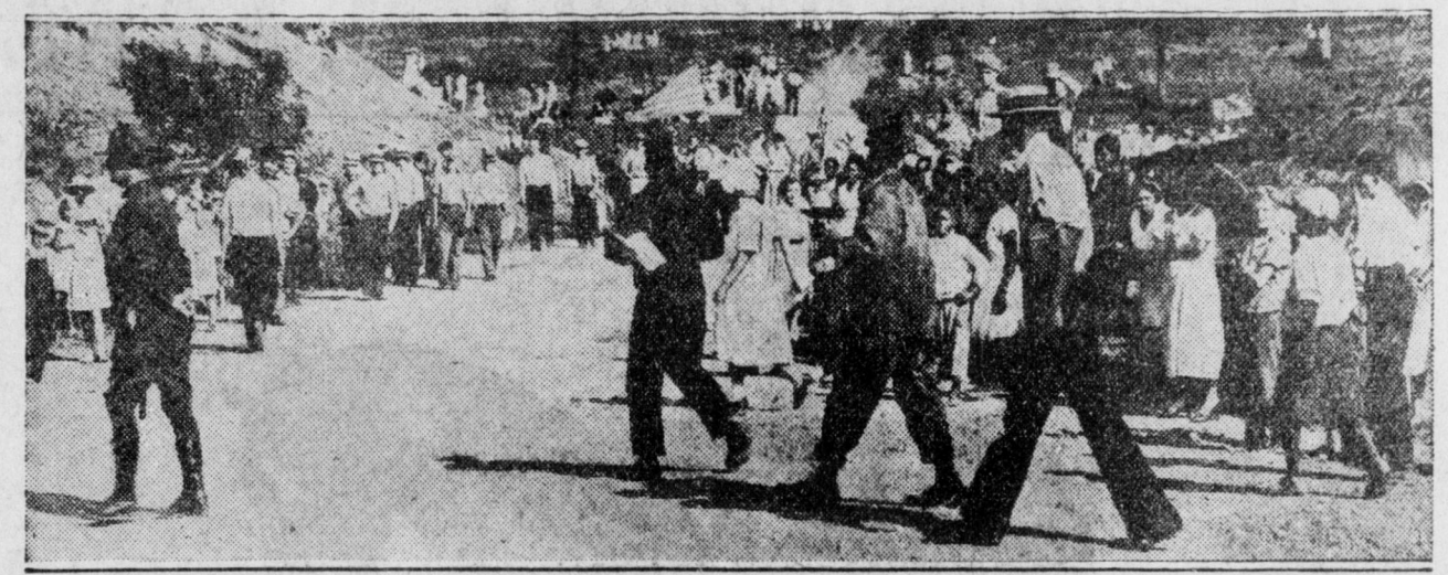
Three scabs being escorted by a gunman through the picket lin es at a striking mine near Edentown, Pa., in the striking soft coal fields

NEW YORK. — Desperate because of their failure to break the strike, conducted by the Knitgoods Department of the Needle Trades Workers Industrial Union, the knitgoods manufacturers have resorted to the help of gangsters, attempting to terrorize the workers and break the strike.