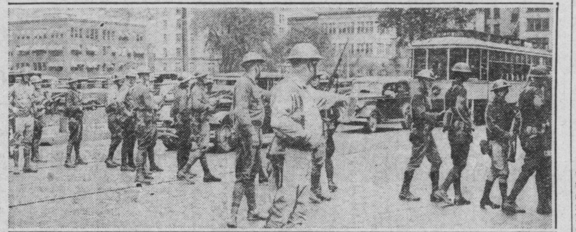
Part of the troops called into Minneapolis by the Farmer-Labor Party governor of Minnesota to break the strike of 6,000 truck drivers. Martial law has been declared in the city, now witnessing its second fierce struggle in recent months.

clation meets every 2nd and 4th Thursday of the month at Labor Temple, 84th St. and 2nd Ave., Room 7.