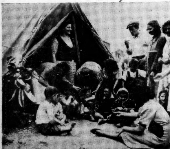
Immigrants in the Shaar Haalyia reception center.

In regard to the cost of living the government talked action and acted chiefly with talk. As a result, prices shot up till meat was the equivalent of $2.20 a pound and eggs $2.16 a dozen. Finally, last October the government appointed an economic coordinator, Sigfried Hoofien, chairman of the Anglo-Palestine Bank. This is virtually the national bank of Israel though most of its shares are owned in Britain by private individuals and companies, including