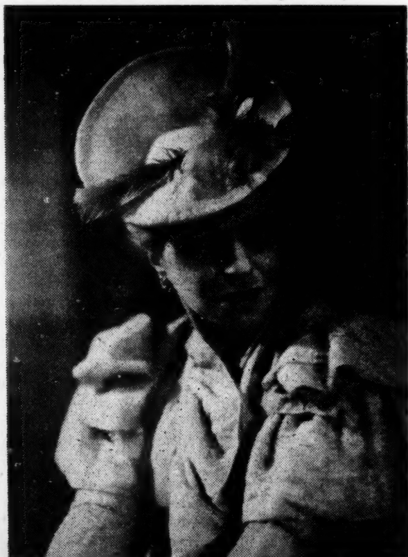
Ida Kaminska in Sholem Aleichem's Menshen (People).

This to me was a remarkable example of the meaning of people's theater. How grateful the artists of the Jewish