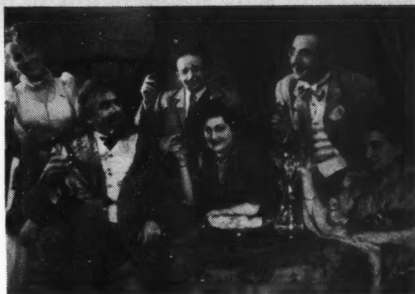
Scene from Jewish Theater's production of Sender Blank .

The audience was enthusiastic in their reception. I went backstage, happy to be able to thank the artists for their work and excited by the opportunity to speak to the members of the Jewish State Theater. Later on at the Theater Workers Club, a charming, homey place where actors, directors, playwrights, all theater workers come together to eat and talk, they explained to me that this production was now playing its last few performances. Most of the audience had already seen it. There is no question of profits involved, since the Jewish State Theater, together with all of the theaters in Poland, is (like every cultural and educational institution) fully supported by the government. The plays just keep on being performed until everybody has seen them.