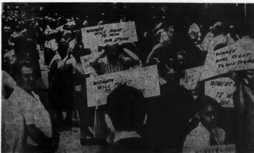
Some of the women strikers on the picket line in the last week of the strike. Some 500 women strikers participated in the picketing, singing and shouting slogans of their demands.

The strike was marked by the militancy, discipline and democratic rank and file organization characteristic of past struggles of the fur workers. Mass picket lines ringed every