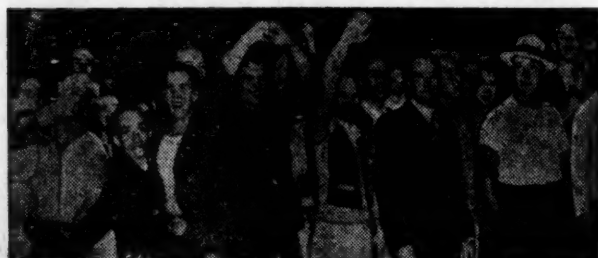
The Cicero anti-Negro rioters seem to enjoy vandalism.