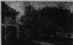
In the shade of an apple tree.

cured from the farmers round about. Vegetables will come largely from our own farm garden on the grounds of the Unity House. The head steward will also have charge of the kitchen, while the cooking will be done by the best Jewish cooks and bakers obtainable. Arrangements will also be made for Italian members and others to have food to their liking. The committee is sparing no efforts to give the best food obtainable, feeling that this is the material basis for the success of the Unity House. The many difficulties of transportation which not prevent the securing of the at last year's Unity House will not prevent the securing of the best food obtainable this year. Comfort in the rooms is assured. Light and airy, with fine bedding, opening out onto porches, with