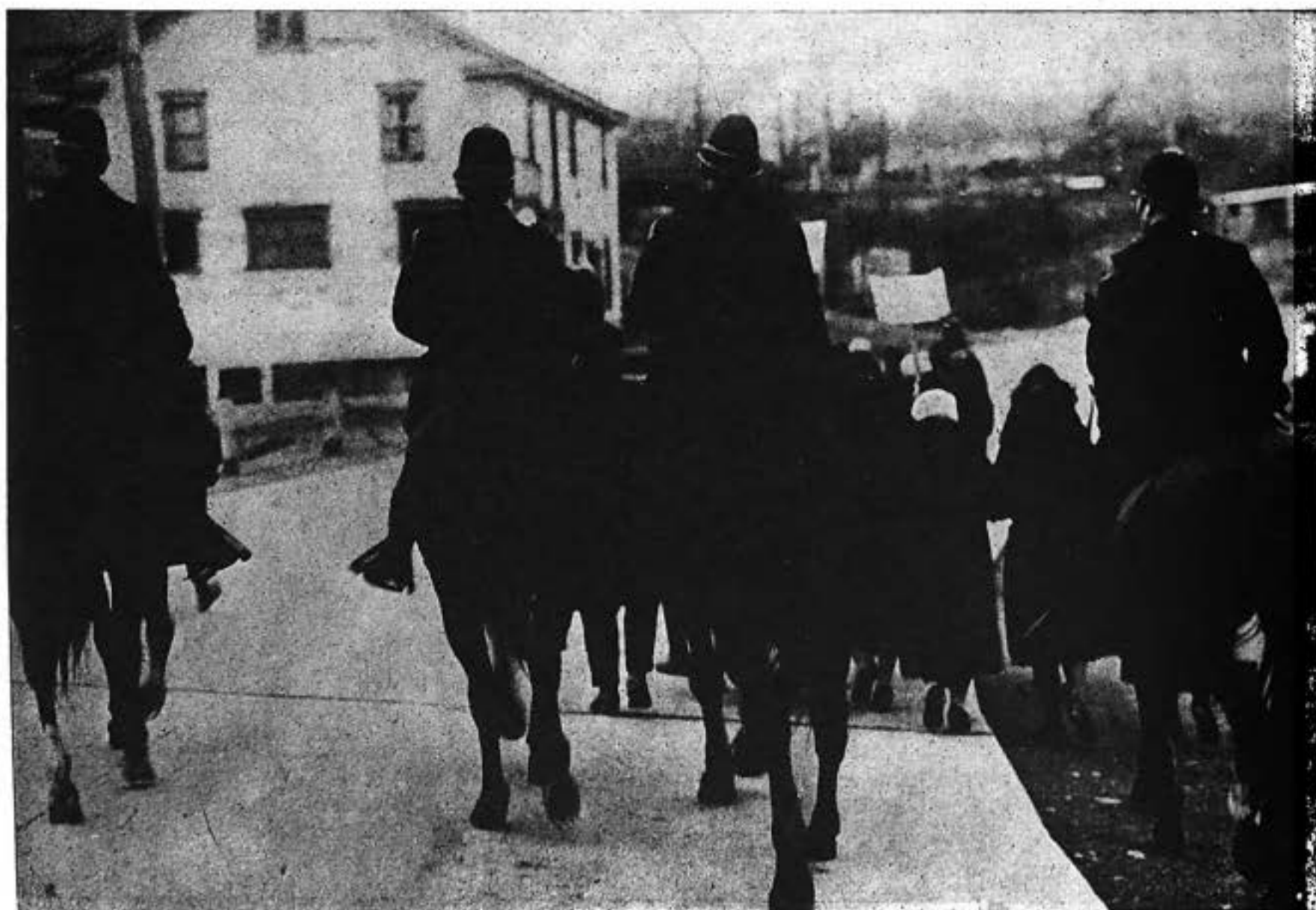
PENNSYLVANIA COSSACKS DRIVING MINERS' WIVES FROM THE PICKET LINE WHERE THEY WERE MARCHING WITH MEN

Tom Mooney and Jim McNamara in San Quentin, Warren K. Billings in Folsom bridge the great distances between their places of confinement