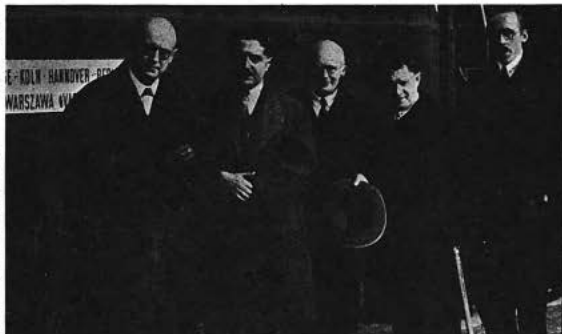
TWO FRENCH AUTHORS MET IN WARSAW BY THE POLISH AMNESTY COMMITTEE

Blue uniforms with rifles in hand. Among them hundreds of arrested ones run quickly through the streets, accompanied every-