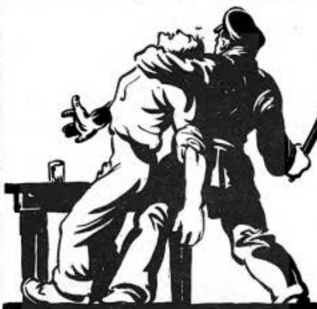
FREEDOM OF SPEECH