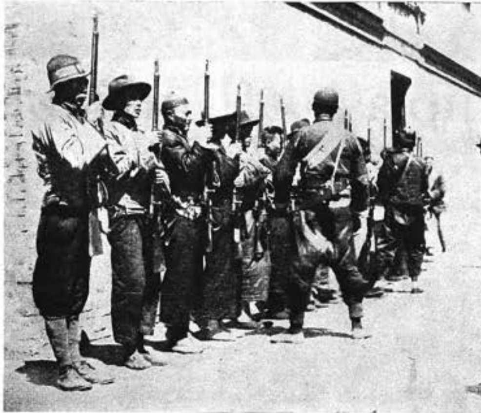
TRAINING THE REVOLUTIONARY WORKERS' MILITIA

ing fire to the wood-piles in the streets of Canton. The victims were burned alive on these piles, oil being