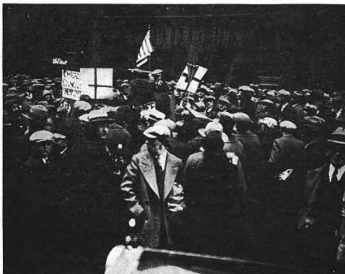
A MASS MEETING OF UNEMPLOYED IN CHICAGO

These men are doubly "criminal", not only because they are unemploy-