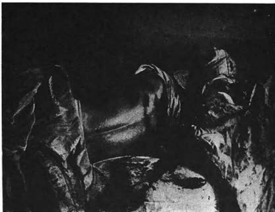
A HROMADA CONVENTION DELGATE AFTER A BEATING BY THE FASCIST POLICE