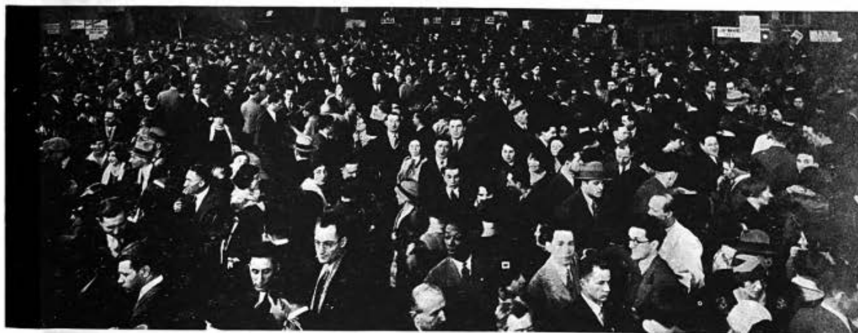
A SECTION OF THE FIVE DAY BAZAAR GIVEN BY THE NEW YORK SECTION OF INTERNATIONAL LABOR DEFENSE