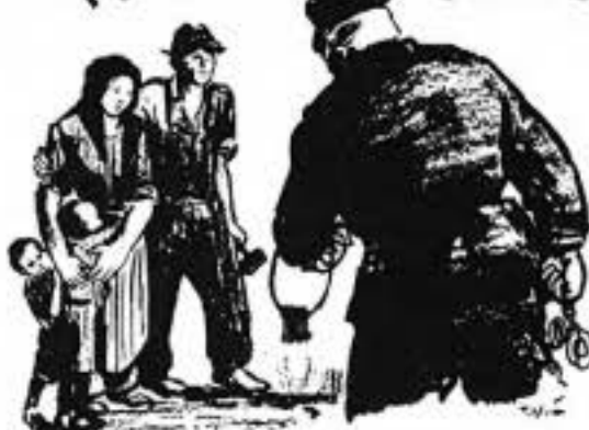
FROM A POSTER BY FRED ELLIS