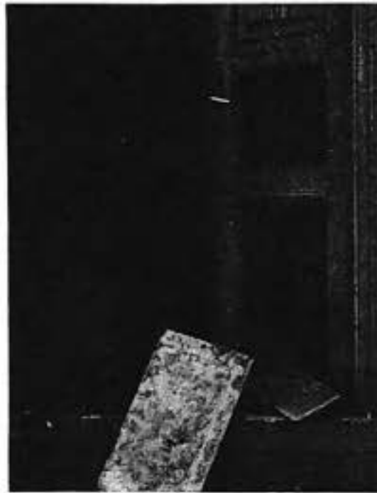
THE HROMADA CONVENTION HALL AFTER THE POLICE ATTACK