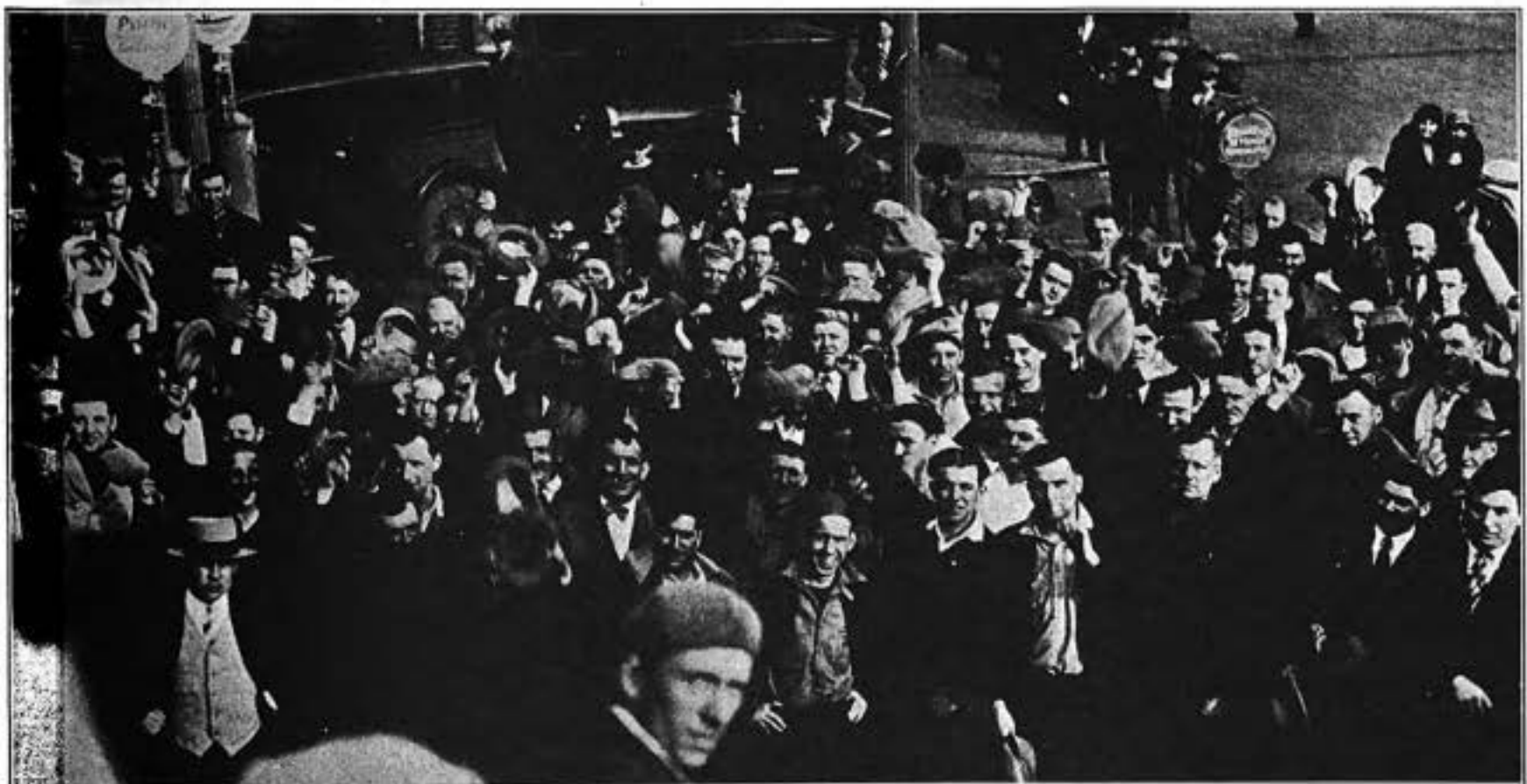
A GROUP OF RELEASED MINE PICKETS ARRESTED BY PENNSYLVANIA'S MEN OF "LAW AND ORDER"