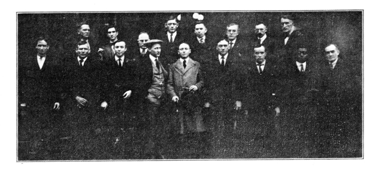
A GROUP OF I. W. W. CLASS WAR PRISONERS

Picture taken just before they returned to Leavenworth Penitentiary.