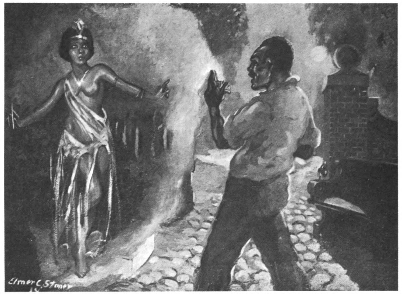
"HE GAZED UPON THE SLOWLY MATERIALIZING FIGURE OF A YOUNG GIRL"

a-singin' an' laughin' low like de music of a sof' wes' wind an' de Cunnel's son follow her right off into de swamp. Den de Cunnel an' his folks see she gone an' dey rushes out into de garden an' see de footprints leadin' into de swamp. Dey calls an' calls but all dey see through de swamp is a body, brown lak sof' velvet, swayin' an' dancin' wid de ruby on her breas' an' her eyes burnin' like fires, an' de boy watchin' wid his lips parted an' a light of joy in his eyes like his spirit was lookin' out. Dey all 'feared of de swamp, dese men, an' dey calls to her an' tells her dat de swamp ain't safe an' to come back, but she jus' laugh an' toss her head an' run right into de heart of de swamp, an' de Cunnel's son, he run right after her, lookin' for all de worl' like a man who's seen at las' all de joy in life, an' pretty soon dey don' hear her laughin' no more an' dey wait an' wait but de Ruby Gal she don' come back for years an' years, an' dey wait all de time, one or another, but dey git ol' an' die an' den she come back.'