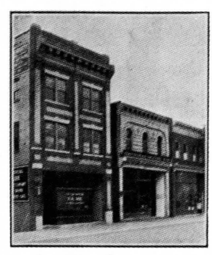
Home Office Group 525-7-9 North 2nd Street Richmond, Va.