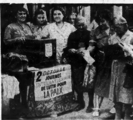
A VOTE FOR THE DOVE In the streets of Paris, a mountain of ballots

I am voting for peace. That means: I want the U.S. to evacuate its bases for aggression in Norway, in England, in Port-Liautey.