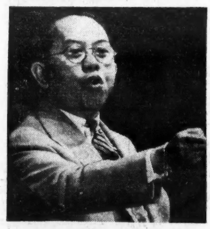
CARLOS P. ROMULO Off to a fast start

THE fourth session of the General Assembly opened last Wednesday. Gen. Carlos Romulo of the Philippines was elected president and immediately whipped the delegates into business with unprecedented speed.