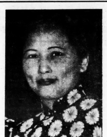
MADAME SUN YAT-SEN The invitation was special

While the delegates pondered the ew China, the Governor of Suiyuan