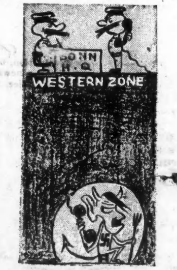
"He wants to kno w many votes

wernigerode is in the Eastern Zone and Prince Ernst-Christian Stolberg-Stolberg, who owned 68,000 acres, 12 forests and five factories, fled when the Russians came. His castle is now the Feudal Museum of the East Zone. In his bedroom stands his four-poster and next to it a pillowed couch and a sack of straw. The museum says one belonged to his mistress, the other to one of his subjects.