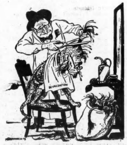
Wall Street Barber Shop

British press reaction was cool to icy. Lord Beaverbrook's Daily Express declared: "We need not have given ourselves over to the domination Wall St."