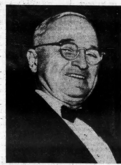
HARRY S. TRUMAN Talks loud, acts soft

their column last week, "means to pre-sent himself as the fighting champion of (these) three great voting groups . . . of (these) three great voting groups . . . (who) are then expected to evince their gratitude . . . at the polls next November. And all this is to be accomplished without the passage of any legislation whatever. The President will strongly insist upon" Taft-Hartley repeal, the civil rights program and the Brannan Plan, But "nothing could upset the