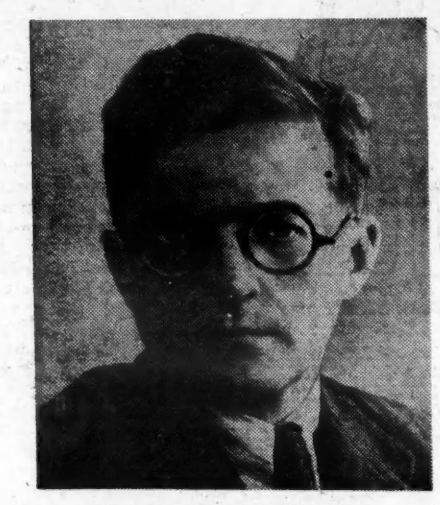
DMITRI SHOSTAKOVICH The ovation lasted 10 minutes

given a questionnaire to fill in later at home.