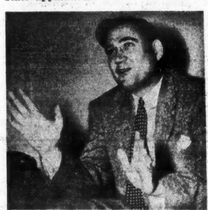
GOV. JAMES FOLSOM Fresh southerly winds

Next day leading churchmen of the state applauded.