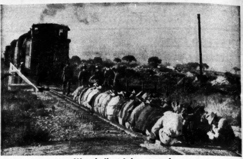
We shall not be moved

Striking potash miners at Carlsbad, N.M., used this method of preventing the operators from working the pits. (See Mine-Mill story, this page.)