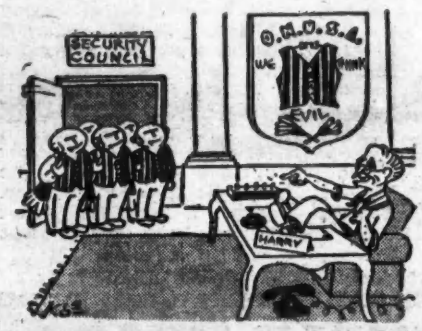
Action, Paris "Did you ring, sir?"

THE VOTES: In a dramatic few moments at the close of the session the Council took four votes, India again supported Malik, but his ruling that agenda items should be voted upon in order of their submission was ower-ruled. Then in a vote on the U.S. draft