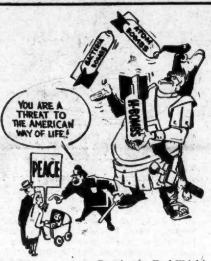
Drawing by Fred Wright

death." C. B. Baldwin, secretary of the Progressive Party, wired Pres. Truman: Unless you move immediately to protect the rights of citizens of New York and throughout the country, who seek by peaceful means a peaceable settlement in Korea and the outlawing of the atomic bomb, they will have no alternative but to regard your words as a hollow mockery, and all people devoted to our traditions of free speech will