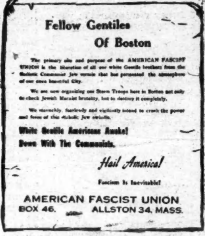
IN THE CRADLE OF LIBERTY

Anti-Semitic groups revived their activities with distribution of a leaflet calling upon all "white, gentile Americans to destroy Jewish-Marxist brutality." There was vandalism in one