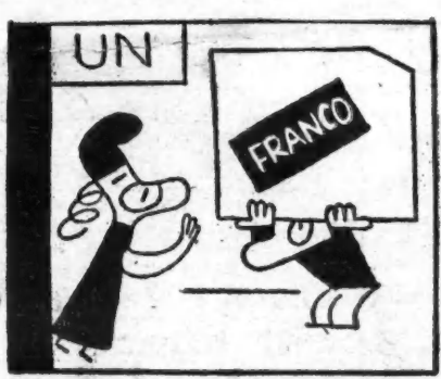
"You sure you have the right address?

baden ...called an unspecified number of former Luftwaffe airmen. An Air Force spokesman explained that the meeting was the "normal sort of thing we have been doing since the end of the war." The N. Y. Herald Tribune, reporting from Berlin that many Germans have bought vials of poison, wrote: Western powers must now decide whether to enlist the armed support of the potentially strongest and most failtful allies in Europe or let them liquidate themselves in the face of Soviet invasion.