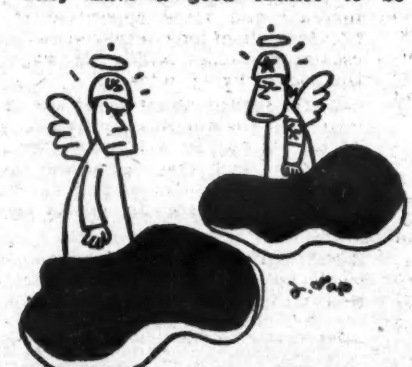
Canard Enchaine, Paris "Couldn't they have thought of mediation before we got here?"

HOW TO DESTROY UN: Though wrapped in a "collective security" cover, Acheson's proposals are seen by sober minds here as the most danger-ous attempt so far to weaken the UN Charter and the Security Council. They have a good chance to be