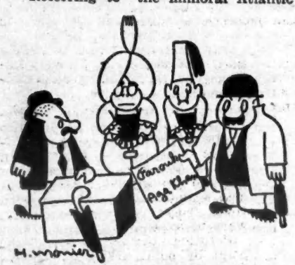
"The Aga Khan and Farouk? Those cen't the undesirable foreigners you were supposed to arrest!"

ported: No evidence was produced to support the deportations. None of the weapons, printing presses and radio transmitters they were said to have hidden were found. Claude Bourdet, editor of the moderate progressive Observateur, wrote: There are in France about a million French Communists and four or five million Communist voters. The few foreign Communists more or less will not do much to change this strength. But these foreigners, Communists or reputed to be Communist, are easy to hit... The French government can now exhibit before its Atlantic colleagues proof of good anti-communism, and the most sadistic of our police can give free rein to their hatred of foreigners... Referring to "the immoral Atlantic free rein to their hatred of foreigners. . . . Referring to "the immoral Atlantic