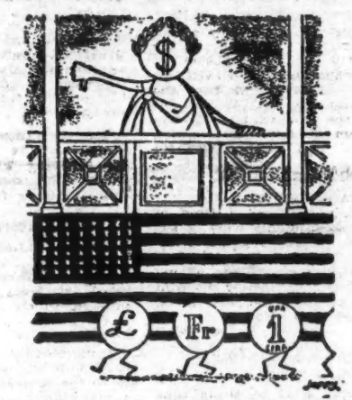
"Hail Caesar . . . We who are about to die salute you!"

more lids: on German production of steel and of ships for export. Restric-tions on other industries were to be re-