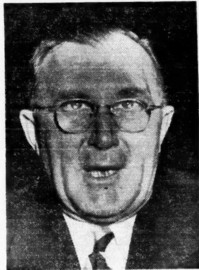
CHARLES E. WILSON You still here?

grass-roots session of the United Labor Policy Committee in Washington's Statler Hotel last March? Then fighting demands were made for equality of representation in mobilization of representation in mobilization agencies, equality of sacrifice between profits and wages, equality of taxes, real price control and real rent con-The platform declared: