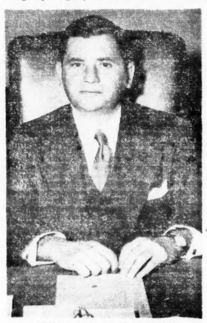
JUDGE IRVING KAUFMAN There were 210 instance:

4. Sobell was denied a fair trial by the misconduct of the judge and prosecutor and by the use of evidence showing that, three years before the conspiracy allegedly began, he was said to have