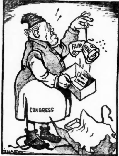
New Orleans Times-Picayune

A "considerable portion" of this, one of his most important state papers, was devoted to "a not too dignified denunciation" of the Soviet regime (WSJ, Jan. 10). The Fair Deal program was presented in "mild and unhopeful tones"