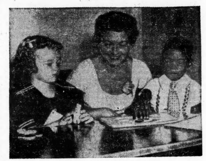
THE FACE OF UNREASON IN DELAWARE . . . AND THE FACE OF REASON IN MARYLAND Left: Hostile faces outside the Milford school; right: peaceful integration in a Baltimore school

Another spoke feelingly of the young people's mission—"and I mean white