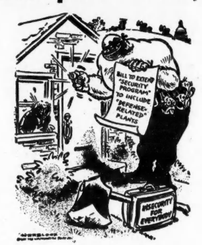
"THE KNOCK AT THE DOOR"

"... as to whom there is reasonable ground to believe they may engage in sabotage of the industrial economy and productive capabilities of the