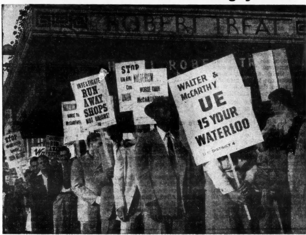
THE PICKET LINE IN FRONT OF THE HOTEL IN NEWARK 2,000 joined the demand for the right to belong to UE