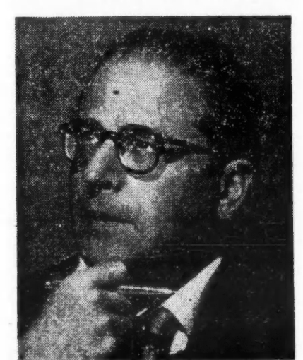
GIOVANNI GRONCHI Oh, those sleepless nights

GRONCHI'S ROLE: In Italy, where the per capita income is about $381 a year, and 4,000,000 out of a working