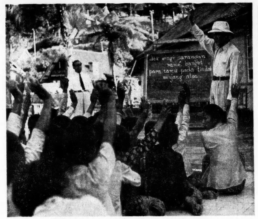
Indonesia: A nation comes into its own

Even President Soekarno (r.) teaches to help wipe out illiteracy in the new re-public which has just held its first nationwide election. See below for details.