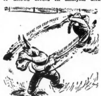
A couple of real dirt farmers.

The failure to advocate socialism is more than a harmless omission: it allows errors in analysis and