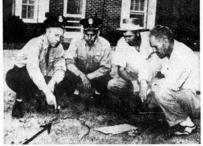
PUZZLE: FIND THE "BOMB" CRATER WITH THE NAKED EYE "explosion" on lawn of plant manager's home

"... they've been raving about labor unions and violence and hinting that I had something to do with it. Wouldn't be surprised at a frame-up effort."