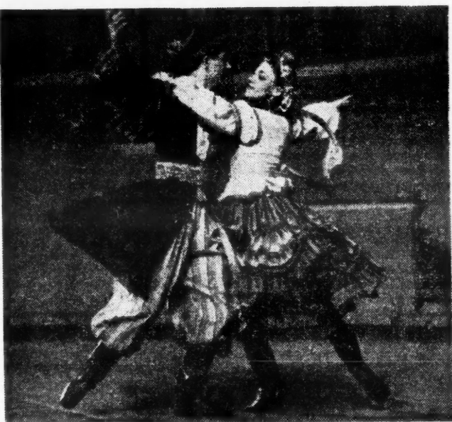
THE MOISSEIEV DANCERS

There have, of course, been dark days during the Wall St.-Pentagon occupation that followed the Nazi occupation; but the unchanged Paris that respects humanity, its infinitely varied