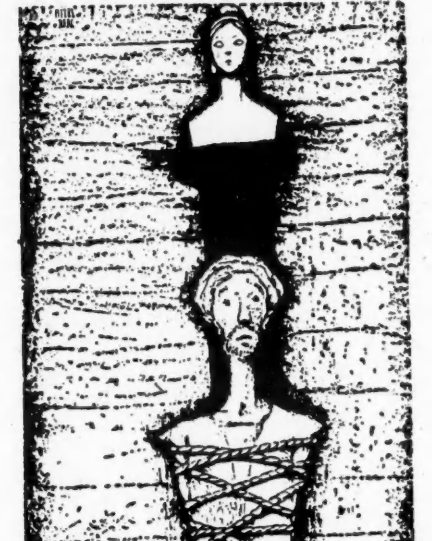
Drawing by Mitelberg, Paris "Of course Algerians are French. . . ."

French settlers in N. Africa, who wield considerable influence over the Assembly in Paris, would not tolerate even the mild concessions to N. Africans Faure suggested. The reason for the settlers' passion for the status quo was made clear in a report of the World Fedn. of Trade Unions delegation that went to Morocco in May to study work-ers' conditions. Describing the appalling condition of disease and malnutrition among the Moroccans, the report said, in Casablanca, workers' maximum wages are $25-30 a month; men, women and children in agricultural work earn 60c, 40c and 25c, respectively, per day worked; child labor is widespread. Peasants fare no better: some 5,000 French settlers own over 2½ million acres of the most fertile land, while condition of disease and malnutrition