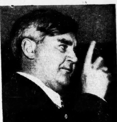
ANEURIN BEVAN The voice came through

THREATS TO BEVAN: On Wednesday THREATS TO BEVAN: On Wednesday fraternal delegate Geddes, from the Trades Union Congress whose bosses rule the party with the card-vote, plainly warned the Left of the wrath to come if Bevan repeated these remarks 'in public" (all Britain had already read them). The TUC tsars were said to have decided that if he did, they would use the card-vote next year. they would use the card-vote next year to change the party constitution, which now allots to Constituency Labour Parties (overwhelmingly Bevanite) seven of the 28 seats on the Executive. This would finally freeze out what the TUC tsars call "the long-haired intellectu-als" from the party's controlling body, where they can now at least make a noise. Actually the delegates from