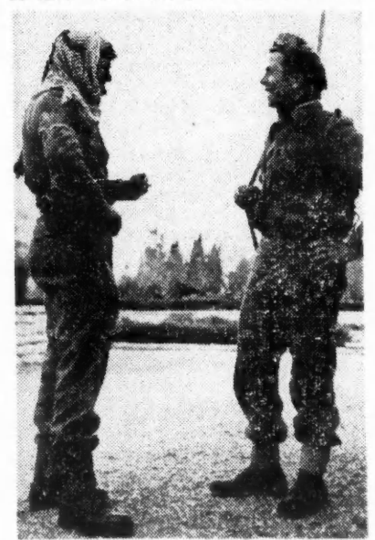
SOLDIERS TWO Arab and Israeli in Jerusalem

WHY EGYPT GOT LEFT: For the last five years, both the Arab countries and Israel have been supplied with arms exclusively from the West. Egypt relied largely on British supplies and Israel late-on French, If the U.S. has