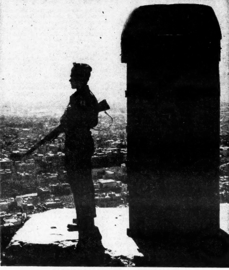
A SENTRY LOOKS OVER A TROUBLED LAND On Mount Likebetos overlooking the city of Athens

"We dread the searing summer days as much as we did the blistering winter nights. No wonder! In cells three yards square three prisoners are locked up 17 hours out of the 24. Last summer, as a punishment, 500 prisoners were locked in 22 hours a day for 70 days, the sick as well as the healthy, without proper latrines or means to clean their cells or themselves. As the majority of us are completing our 12th year of jail, our health, mental and physical, will scarcely support another such summer, or a winter like the last. If you mean to help us, to call attention to our desperate plight,