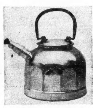
No. 176, WHISTLING TEA KETTLE