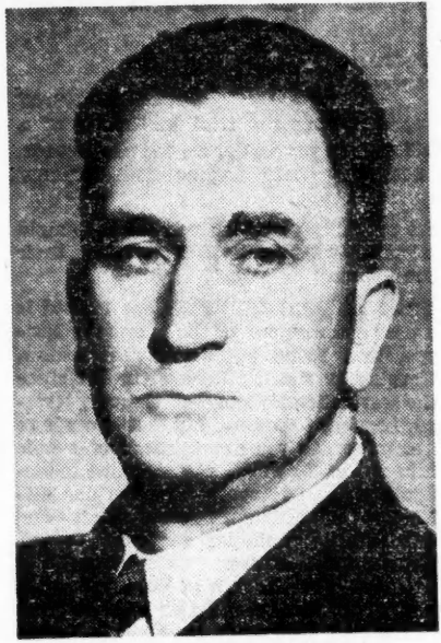
THE FACE OF UNREASON

and opportunities of all sections of the people irrespective of race, color and creed." He has called for support from the Chambers of Commerce and Industry and trade unions "to prevent the country's economic progress and welfare being disrupted" by apartheid. Uneasily observing that the new measures might set up unwelcome precedents affecting all property rights, opposition members of the Parliament and Provincial and City Councilors have also protested