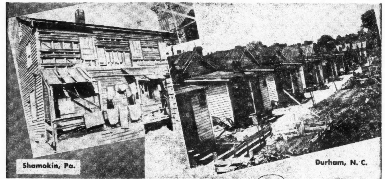
NORTH OR SOUTH, THE SAME DIFFERENCE Poverty haunts textile workers no matter where they work

tion required by the first step and the administrative reforms required by the