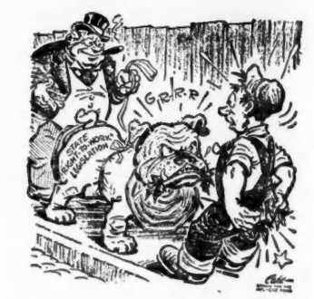
AFL-CIO He's a watchdog—to guard your rights

GHOST TOWNS: Irresponsible management has as its monuments the textile ghost towns of New England and the mid-Atlantic region where "countless mills have been used as pawns in the