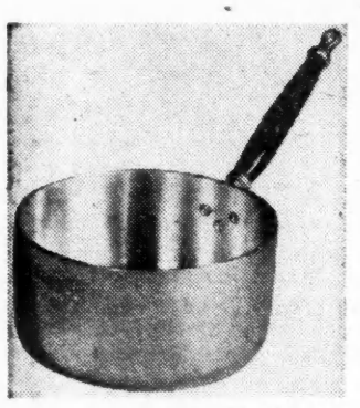
No. 117. WATERLESS COOKER with COVER. 5/16" bottom. Also available with side handles.