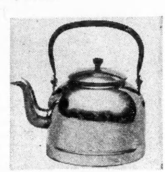
No. 174. TEA KETTLE.