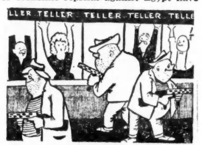
ociation of Users of Bank Bills.

Western gunboat diplomacy and threats of economic reprisal against Egypt have