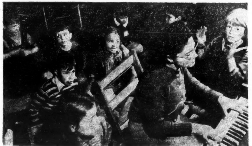
CHURCH VS. STATE IN THE CLASSROOM Do children need a teacher or a missionary?

er, director of instruction field services of Florida's Dept. of Education, was trying to teach religion to public school children without getting tangled in inter-denominational fights. His program, limited this year to Florida schools that volunteer, instructs the teachers to refer all theological questions to a priest, rabbi or minister acceptable to the parents of the child who asks them.