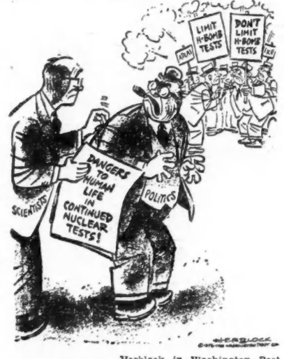
Herblock in Washington Post "You keep out of this!"

BULGANIN'S LETTER: In the midst of the heated exchange, Soviet Premier Nik-olai Bulganin wrote and almost immediately released for publication a note to the President repeating earlier Soviet offers to negotiate an agreement banning all further atomic weapons tests. The note was almost unprecedented not so much because it entered election year politics but because it seemed to take seriously what was being said in the campaign—