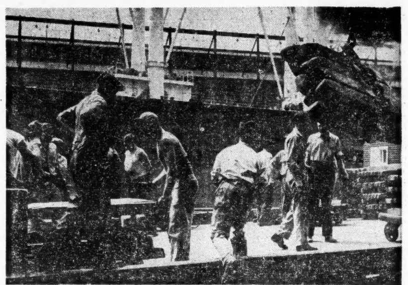
THE ELECTION WAS LIKE A "SUNDAY SCHOOL PICNIC And all was quiet along the docks of New York harb

Curran also challenged the New York-New Jersey Waterfront Commission which was set up by the two states at the time of the ILA's expulsion to "clean up" the waterfront. He said "its only 'accomplishment' has been to move the vicious shape-up from the streets and