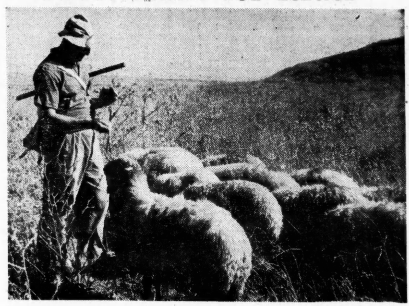
THE DESERT COULD BECOME A LAND OF MILK AND HONEY A farmer-shepherd tends his flock in Israel