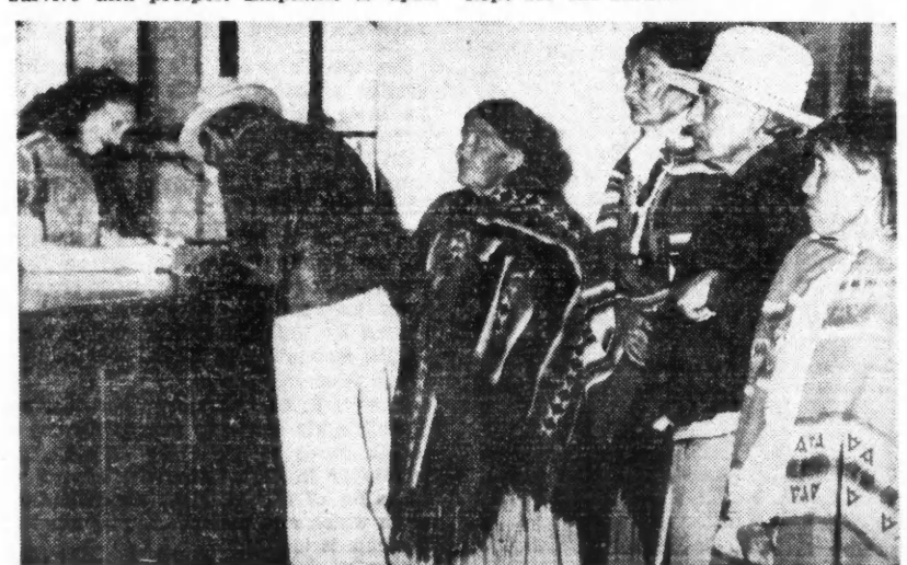
NAVAJO INDIANS QUEUE UP TO REGISTER his photo was taken in Gallup, New Mexico.

coming largely from the strength of the Indians themselves: "The greed of the invaders has gradually taken our wealth from us. We have left only our political power with which to improve our conditions... Our vot Our votes are our greatest