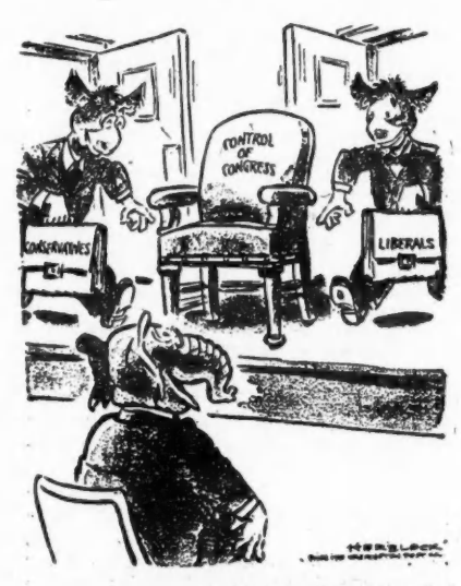
"I think maybe I'm going to enjoy this."

The Northerners' declaration seemed to indicate a growing split between Congres-