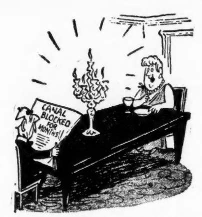
Vicky in Daily Mirror, London "By the way, dear, what became of Sir Anthony's canal USERS' association?"

They glumly recalled that only a few weeks ago a Britain starving for dollars—but now starving for oil—had had to sell to U. S. interests its only Western Hemisphere oil holdings in Trinidad. The peak of futile exasperation was reached in