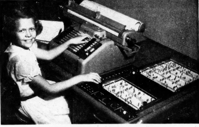
EVERY TOT A TANTALIZING TOTALIZER ew Burroughs "desk-size" brain gets a corny se brain gets a corny send-off

the heavy-industry automation which, in its primitive stages in Detroit, is already producing more cars faster and with fewer hands than ever before. But the exhibit of the Baldwin-Lima-Hamilton Corp. offered a clue. A salesman-engineer pressed the numbered keys on an instrument board and explained that he was feeding in the precise specifications for steel tubing, tolerances for length, weight,