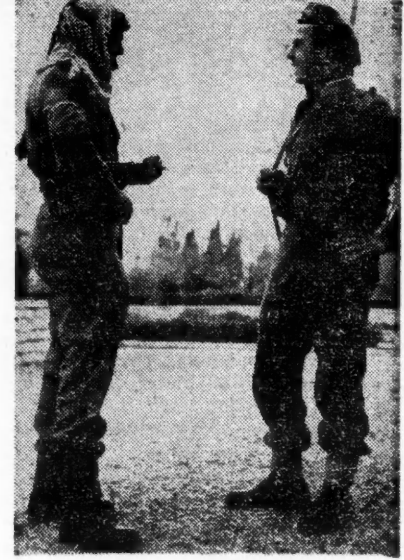
United Nations phot THEY COULD BE FRIENDS Arab soldier and Israeli soldier

the keynote of such a conference. Under the present tense situation, aggravated by the war in Egypt, it would be idle to expect long-range solutions of all Middle Eastern problems, or to attempt even a partial solution of the Israeli-Arab conflict except within a larger frame of reference. In the process of give and take, Egypt might be willing to sign a peace treaty with Israel in return for aid to build the Aswan Dam, channeled through the Special UN Fund For Economic Development. Other Arab countries might be persuaded to follow suit in return for economic and technical assistance for irrigation and other projects, also channeled through the UN.