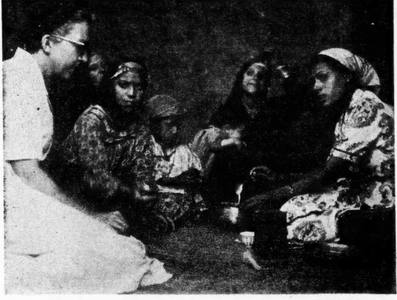
THE FAO HELPS EGYPTIAN VILLAGERS TO A BETTER LIFE onomist instructs women in preparing milk formula for infants

cause this was an agreement with a s cialist country but because it showed the government was determined to follow an independent policy. The Suez nationalization followed, bringing Nasser universal support in Egypt and tremendous prestige throughout the Arab world.'