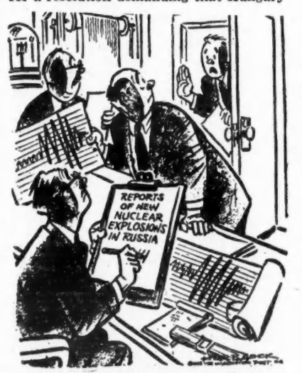
ck in Wash That last one was Khrush-chev again."

In the UN Cuba, in the midst of bloodily crushing its own uprising, led the fight for a resolution demanding that Hungary