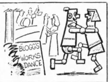
Daily Mirror, London

GLOBAL DEADLINE: Industrial leaders have said soothingly that automation would come gradually and there would be no sudden shock. But there were signs