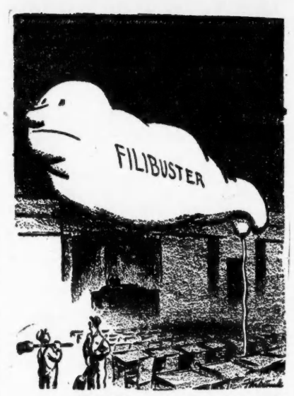
razpatrick in St. Louis Post-Dispatch think they'll get rid of it, Bill?"

In the House, liberal Representatives were planning to act early in the session on civil rights bills so that if a filibuster developed in the Senate there would be plenty of time to cope with it. But many thought this session of Congress would not get much beyond the Eisenhower wa-tery civil rights "package" which passed the House last year but died in Senate committee. The President himself remained cautiously aloof from the rules change issue. His package, which is expected to be re-submitted this year, would set up a bipartisan commission to study