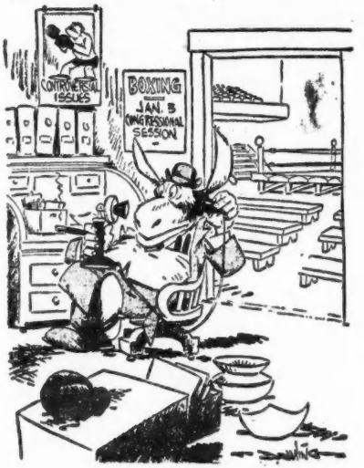
Y. Herald Tribune Difficulty lining up a card

Even Sen. Knowland got a free ride under the Johnson strategy. He voted to kill the Anderson motion, but announced kill the Anderson motion. but announced that he will sponsor a rules change later for consideration in an "orderly way." He will propose that debate can be shut off by a two-thirds majority of Senators present and voting, instead of the two-thirds majority of the entire Senate (64) under the present Rule 22. His proposal would also apply to debate on a motion to change the rules, which is presently unlimited with no way to shut it off except through exhaustion. He will submit cept through exhaustion. He will submit his resolution to the Senate Rules Committee. Few Senators give it the ghost