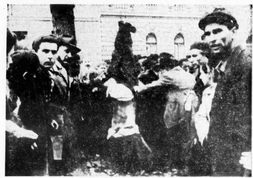
STREET SCENE IN BUDAPEST IN LATE OCTOBER 'Who identified the victims for us?

But SOMEBODY should have known that socialism could manage without quick collectives but not without the peasants' love. Somebody should have