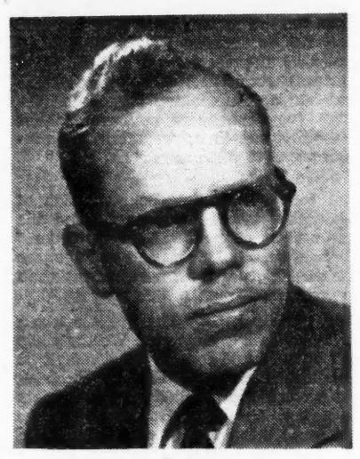
ERIC HASS Top Socialist vote-getter

SLP occupies one floor of a loft building at 61 Cliff St., near the Fulton Fish Market in lower Manhattan. It has one