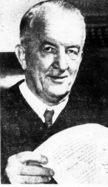
JUDGE EMMETT C. CHOATE He made the Florida ruling

Following is a summary of the busintegration fight on other fronts: