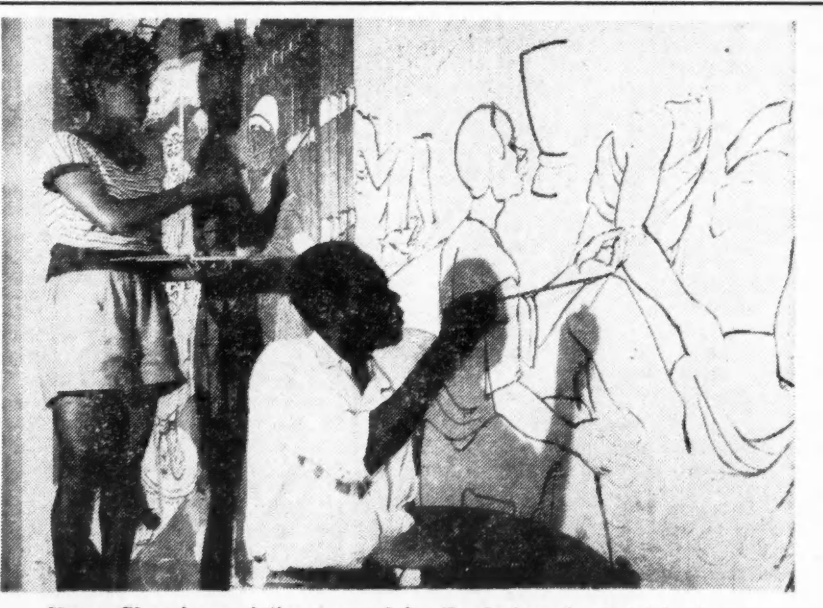
Young Ghanaians painting a mural for the Ambassador Hotel in Accra.

The University College campus in Accra. Note the modern building design and students in gowns,