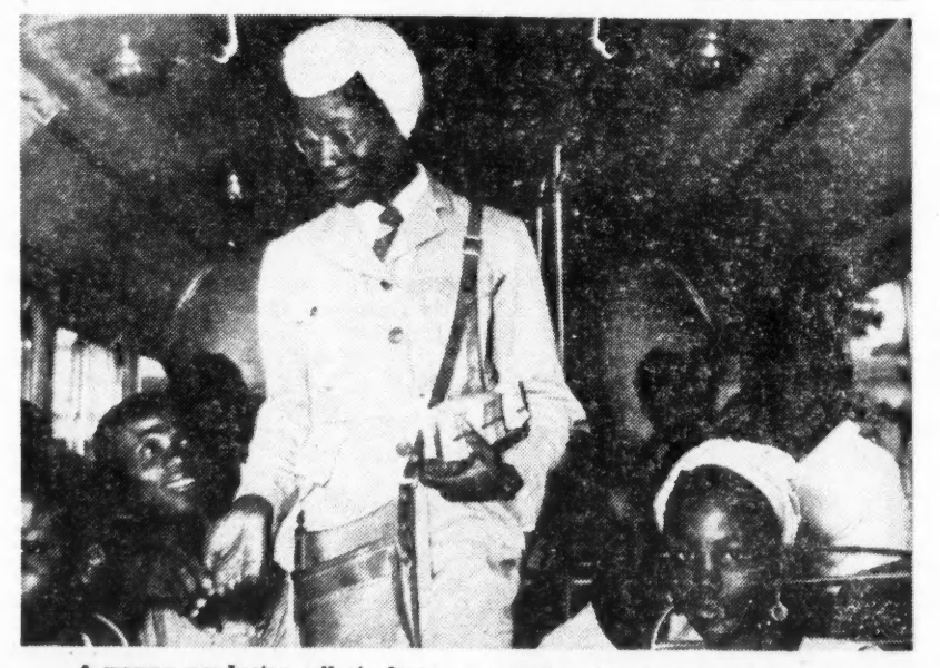
A woman conductor collects fares on a modern bus in Kumasi, Ashanti.