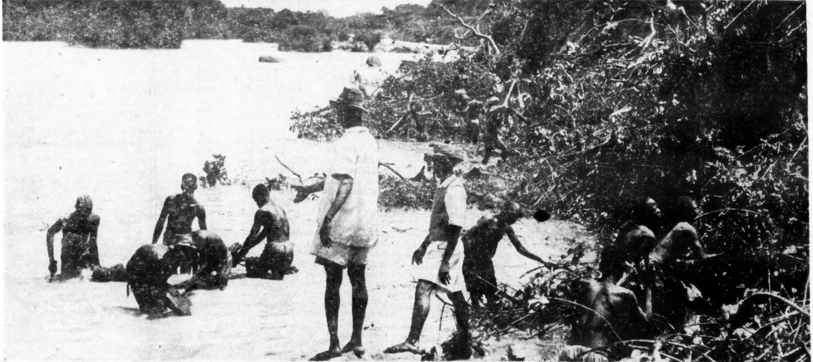
These men are working on a project along the river banks to control the tse-tse fly in the Northern Territory.