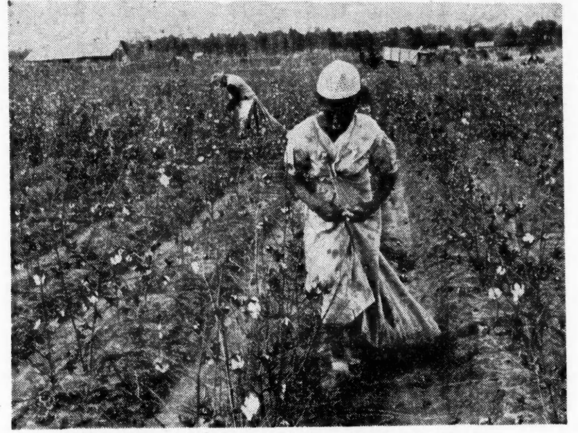
THOSE WHO PRODUCE THE NATION'S FOOD AND FIBER . Receive so little of the fruits of their back-breaking labor