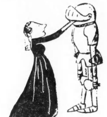
Vie Nuove, Rome

Labor, it seemed, would not be likely to go scot-free, as G.E. had done. Employers were certain to use the Portland scan-dals to smear unionism in general. While top AFL-CIO leaders promised "full cooperation" to the McClellan probe, the N.Y. Times quoted an unnamed Senator as drawing this moral from developments in the bawdy-politic: "Well, we finally found out we could go after the labor leaders without incurring the wrath of labor."