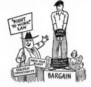
mic Outlook, CIO

heart set on a whopping State tax boost which he hopes to wangle through the legislature this term. The Indianapolis Times explained: "On the blazing right-