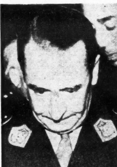
GEN. PEDRO ARAMBURU He likes the landlords

THE RADICAL LEADER: The Radical Party survived as an opposition voice—however tamed and harmless—during the Peron era. Until recently it had been a large but amorphous group appealing