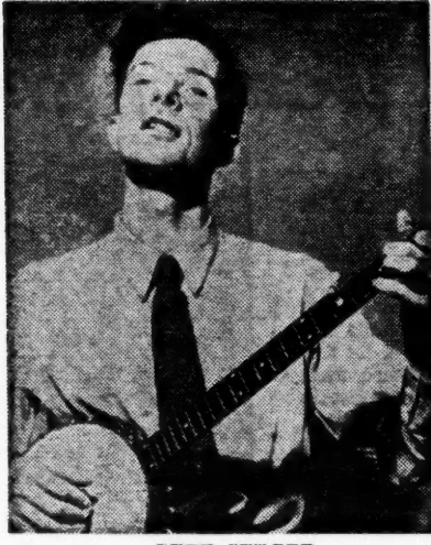
PETE SEEGER Sings for people, not committees

CP CHALLENGE: Back in Washington. attorneys for the Communist Party filed a 99-page brief challenging the Sub-versive Activities Control Board's finding that the CP is foreign-dominated and must register under the Internal Security Act. The registration order was handed down in 1953 but was returned to the Board last year by the Supreme Court