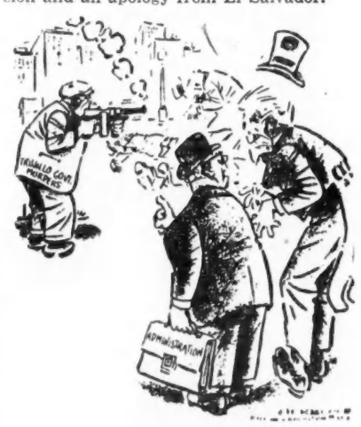
"Now, in this case, we recognize the government, but we don't see the machine gun."

migration laws were being revised. It was the nearest thing to an admission and an apology from El Salvador.