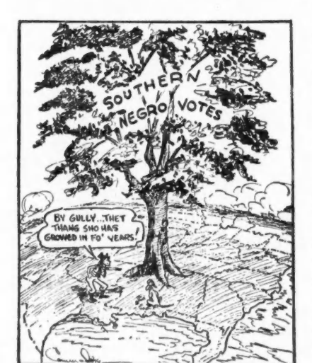
A tree grows in the Southland

Sen. Ervin questioned Walden's right to complain. Wasn't he "one of the wealthy men of Georgia"? Even if it were true it would be immaterial to the issue before