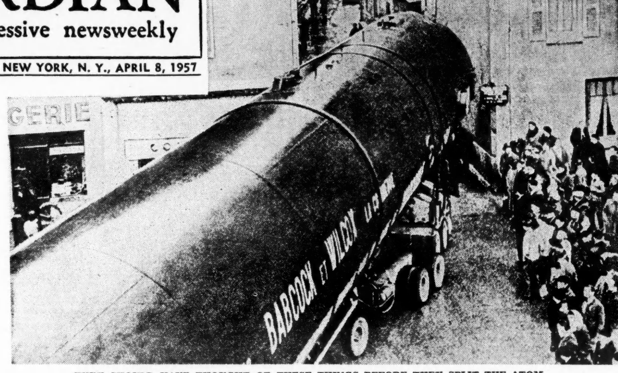
THEY SHOULD HAVE THOUGHT OF THESE THINGS BEFORE THEY SPLIT THE ATOM A 163-foot cylinder for an atomic plant is snaked through an ancient village street near Chartres, France. It took days for the "atomic centipede" to be pushed, pulled and squeezed a distance of 50 miles.