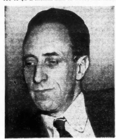
HARRY BRIDGES Labor wants senior status

The convention also voted to increase per-capita dues to the international from 75c to $1 a month and to boost the sala-