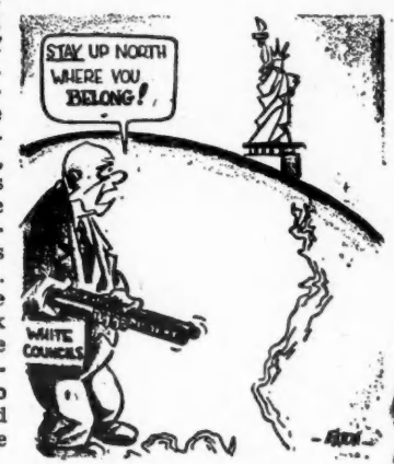
Baltimore Afro Ame No place for her behind the Cotton Curtain,