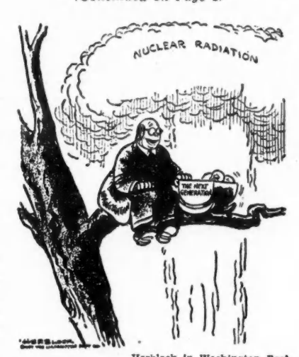
Herblock in Washin Let's make believe the fallout will stop"

The GUARDIAN's Cedric Belfrage wrote from London that Prime Minister Macmillan granted the Matushitas and two other members of their mission half an (Continued on Page 4)