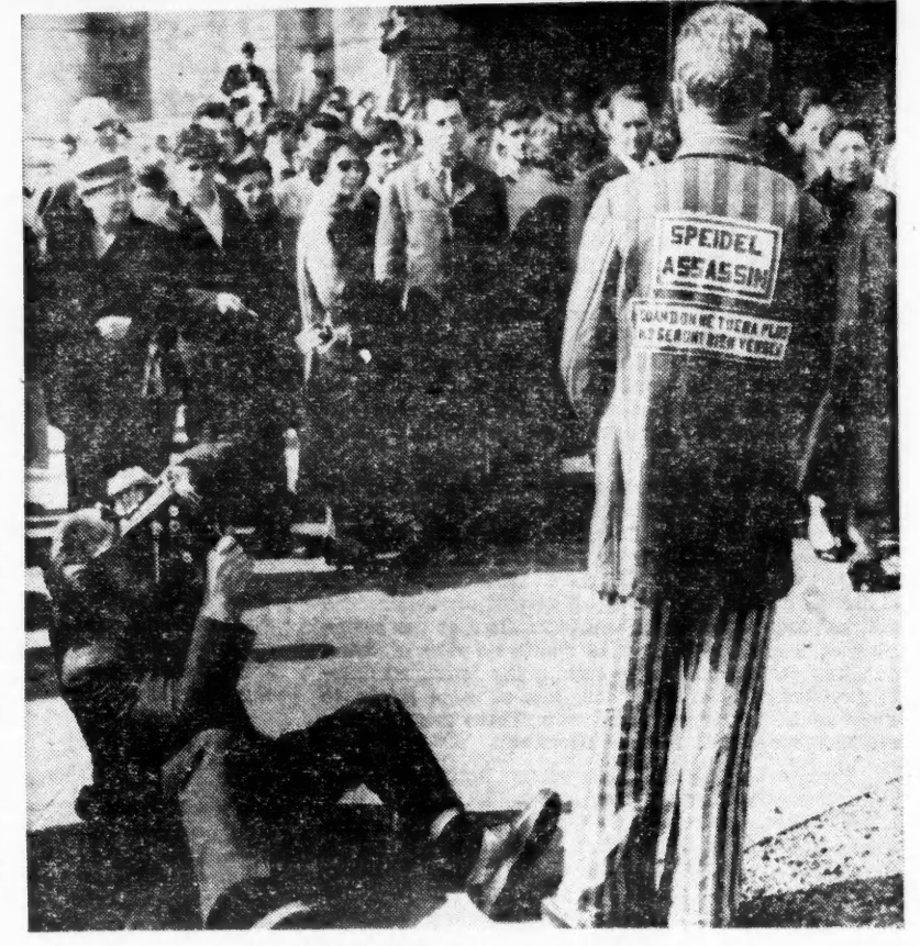
IS NATO SHORT FOR WEHRMACHT?

At a demonstration in Paris against the appointment of ex-Nazi general Hans Speidel one man showed-up in a concentration camp uniform. The sign on his back says: "When there is no more killing [Nazi] victims will have been avenged."