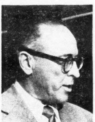
DALTON TRUMBO Aired the issue publicly

THE KING IS NAKED: Although an editorial in Daily Variety lamely attempted