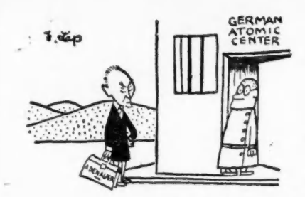
"Aren't you ashamed to refuse H-bomb work when you think of your Russian and American colleagues?"