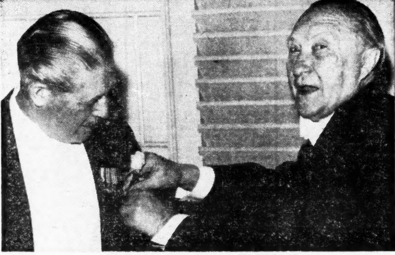
ADENAUER PINS ONE ON MACMILLAN

These fears and differences feed, too, on basic national rivalries. Some British papers, for example, suggest that the W. German fuss over British manpower cuts in Germany arises from the fact that this will also mean a cut in the sum the British pay Bonn in dollars and gold for