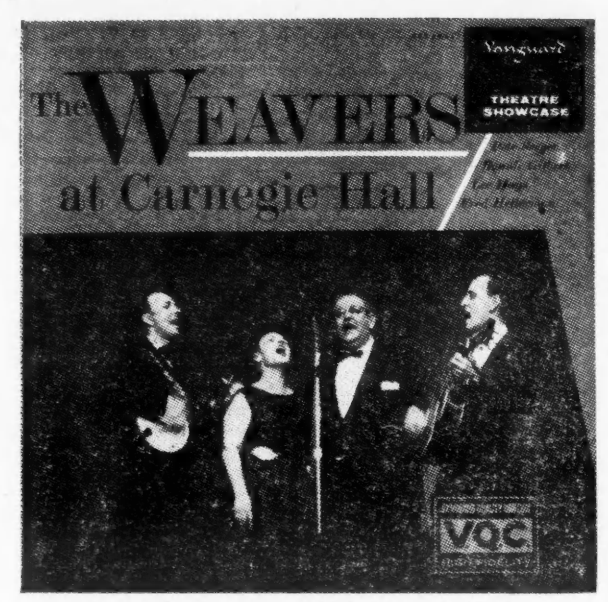
Recorded at their Christmas, 1955, Carnegie Hall concert