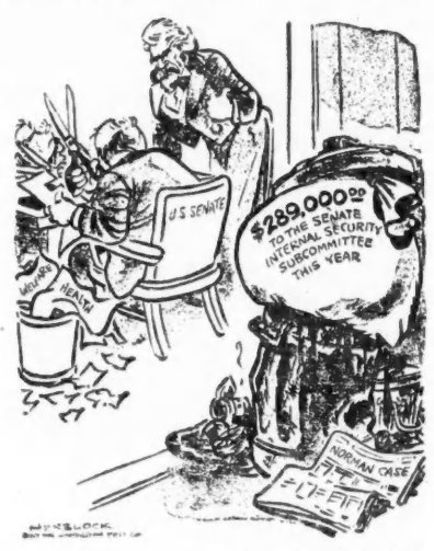
"You fellows say you want to save money?"