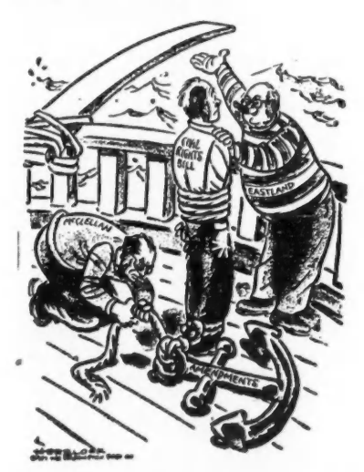
"We're not going to keep you cooped up in the hold."

Since an injunction against continuation of the blacklist would also then become a probability, the total effect would reach into every area where economic reprisals have been used to stifle political non-conformity.