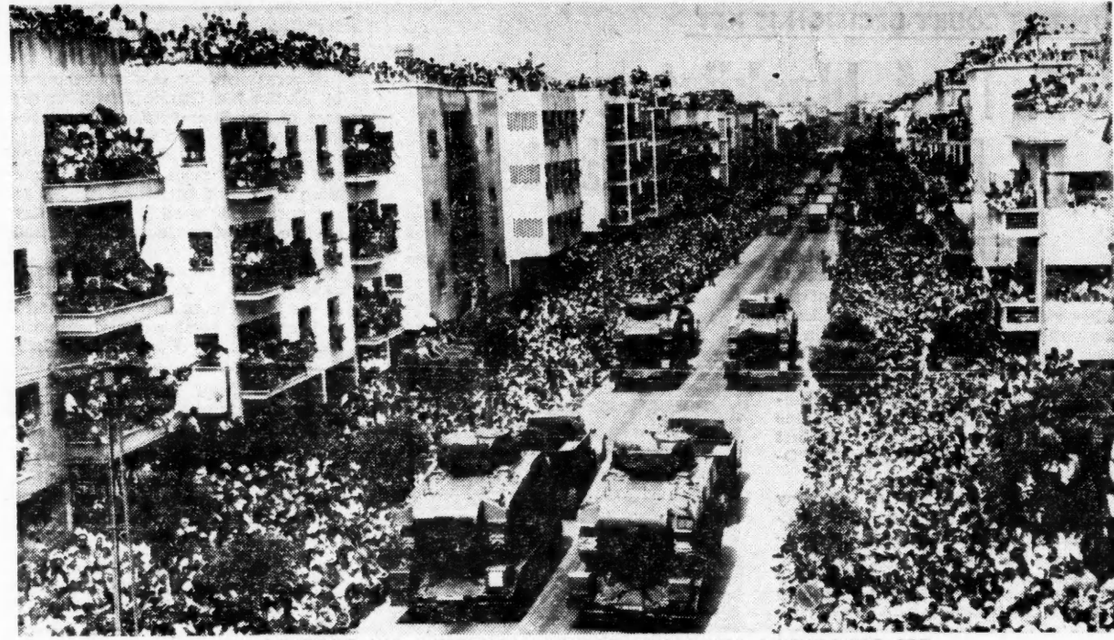
A PARADE AND A BIRTHDAY SUIT OF ARMOR FOR A NINE-YEAR OLD Heavy tanks rumble through Tel Aviv as Israel celebrates her Independence Day, May 6