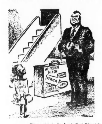
"Any good will left for Alabama?"

THE "TALENTED TENTH": Even prominent Negro leaders long thought that a Negro intelligentsia would be able to lift the Negro mass upward as a largely self-