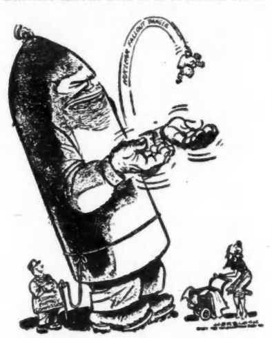
Herblock in Washington Post "Look, lady—you don't see me worrying."

A motel called the Riverside Cabins on U.S. 91 on April 25, 1953, received the heaviest fallout dose ever recorded on an