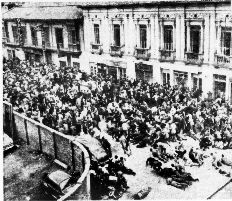
STUDENTS PASS TYRANNY'S TEST

Censorship has prevented photo coverage of recent events in Colombia, but reports told of scenes like this one, in 1954, when troops fired on unarmed students parading in Bogota, killing 15 and wounding 20. Note some pausing to care for the wounded.