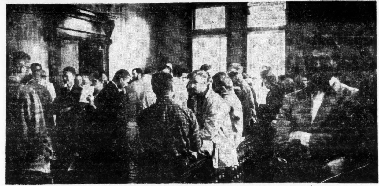
THERE WAS A FAIR SPRINKLING OF BEARDS IN THE COURTROOM AT THE HOWL TRIAL

KHBUSHCHEV'S OFFER: The beeps of the sputnik and the roar of a new Soviet hydrogen weapon, whose successful test