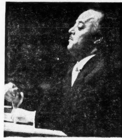
AHMAD SHUKAIRY The language was harsh

SHOPPING FOR ARMS: The Assembly took up first Peking's claim to China's seat, then Middle East issues. Despite India's eloquent plea, Peking's claim was rejected, but by a smaller margin than last year: 27 members, including Ghana,