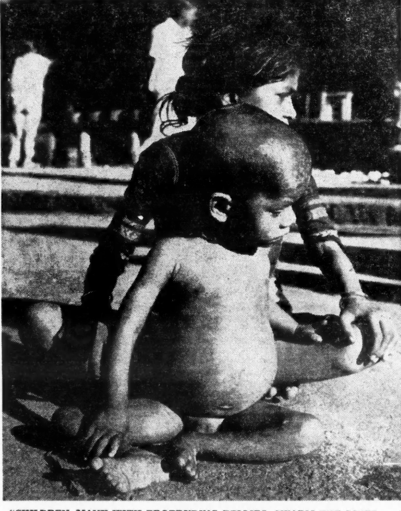
"CHILDREN, MANY WITH PROTRUDING BELLIES, SWARM THE LINES . . ." Food and land and health and jobs: the problems of India

• Teachers be chosen from a panel selected by the Public Service Commission—to eliminate the practice by which teachers had to pay 500 to 1,500 rupees to get jobs and by which unqualified teachers often got appointments. • In cases of gross mismanagement,