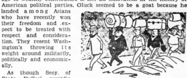
Nightmare of colonialism

As though Secy. of State Dulles' periodic bumbles were not dam-aging enough, Washing-