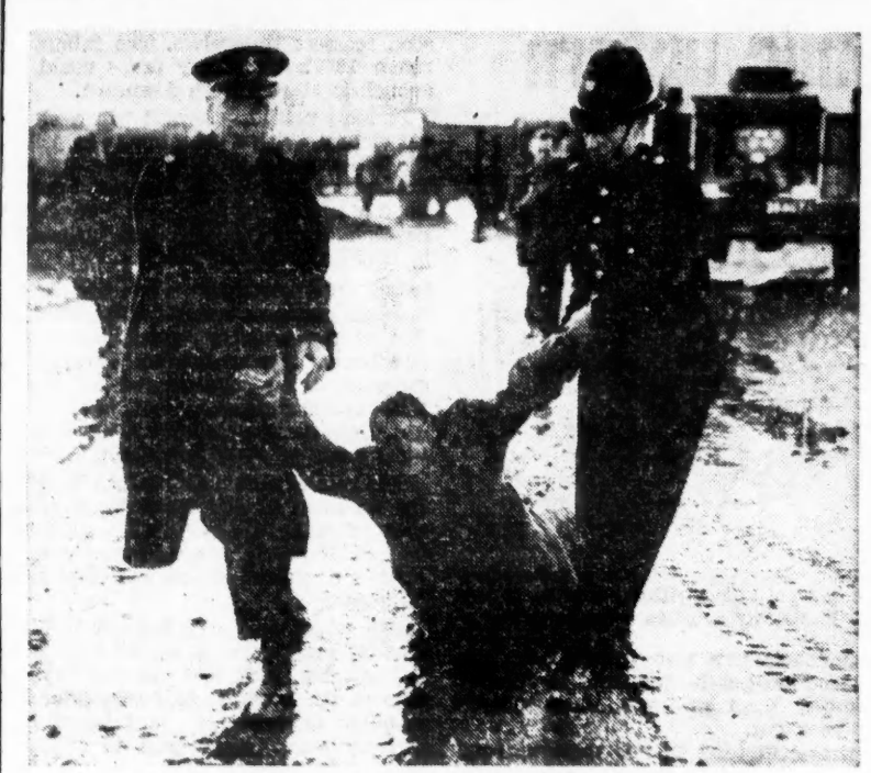
A BRITISH PACIFIST DEMONSTRATOR MAKES HIS POINT