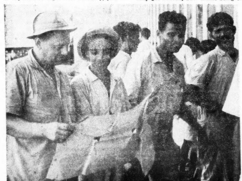
A RUSSIAN AND AN INDIAN ENGINEER CONSULT A BLUEPRINT Part of the Russians' job is to share their knowledge

The luckier or more enterprising few will be launched on the road to a good life as trainees in Bhilai's technical institute, where Soviet-trained Indians will continue to spread Soviet know-how after the last plane-load of Russians flies home.