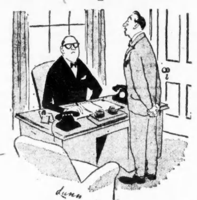
London Daily Mirror "I could get along without a raise, if you know any substitute for food."

The character of the recovery shapes the outlook for 1959. With the rise of $2 billion in military spending, there is going to be a deficit of $12 billion this fiscal year. But if the new rate of military contract-letting is sustained, the arms budget will have to go up another $10 billion over the next two years. If Con-