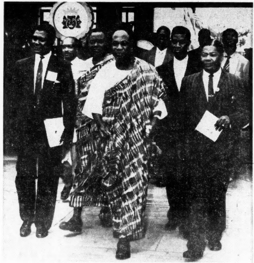
NKRUMAH (c.) WITH LEADERS OF THE ACCRA CONFERENCE Their one-word message to all colonialism; "Scram!"

On the settlers, Mboya made it clear that the Africans asked for an end to exploitation, which could be easily and