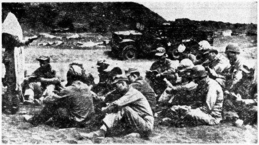
A service for Jewish soldiers during World War II

But the resumption of unimpeded trade over the whole world would lead to demands for mechanical, electrical and chemical plant—witness the Soviet offer to buy chemical equipment to the value of several billion dollars—so that the dislocation caused by stopping the arms race could soon be overcome.