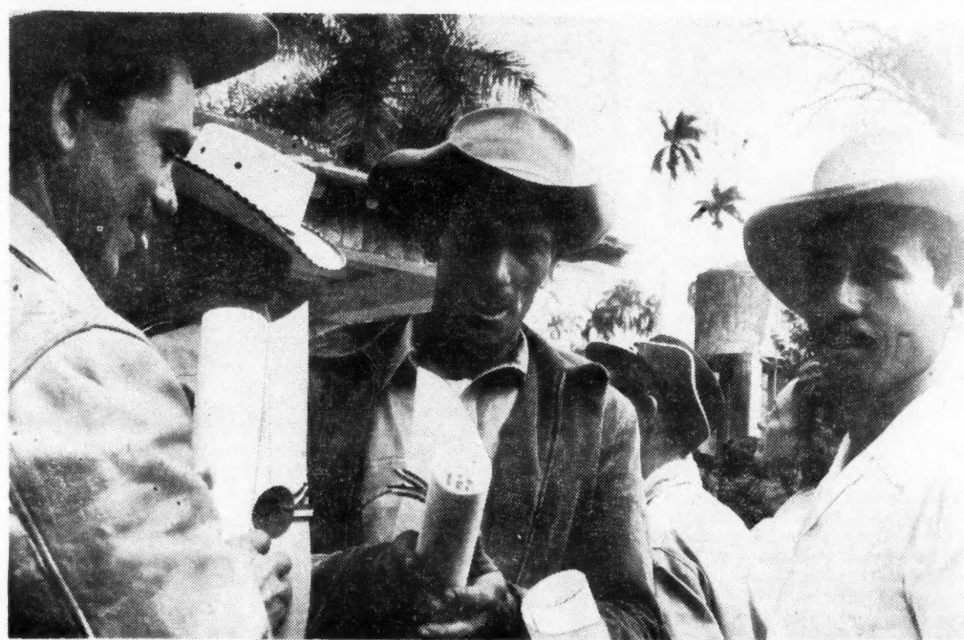
THESE THREE HOLD BRAND NEW DEEDS TO LAND BEING DISTRIBUTED IN THE REFORM PROGRAM

of Arbenz, the Cuban people wonder what next