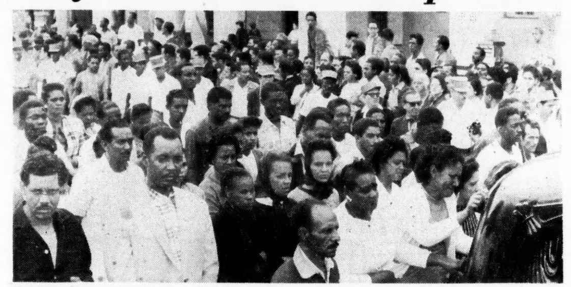
HAVANA MOURNERS WATCH A HEARSE BEARING A VICTIM OF THE MUNITIONS SHIP EXPLOSION