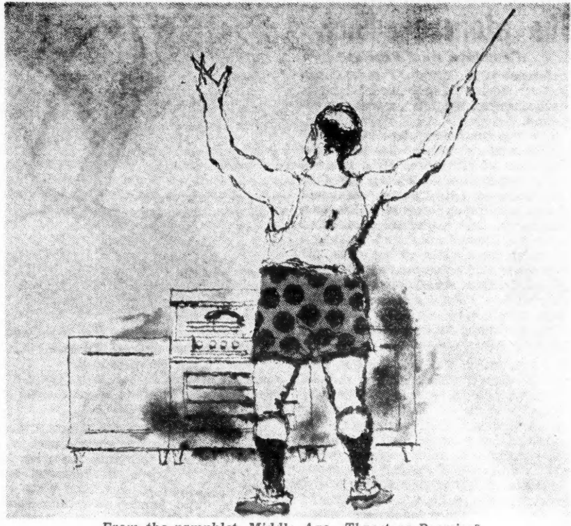
From the pamphlet, Middle Age-Threat or Promise?

"No sterile orthodoxy should be permitted to block the path of inquiry into new situations," Dr. Blumberg says, and adds: "The philosophic guide to such inquiry