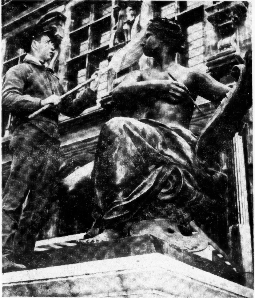
SPRING CLEANING IN PARIS FOR A VERY SPECIAL OCCASION A statue in front of the City Hall gets the broom as part of the general face-lifting that went on in the last weeks in preparation for the visit of Premier Khrushchev to the city where the Can-Can was born.