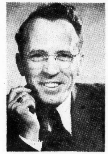
PREMIER TOMMY DOUGLAS

THREE WINGS: CCF, like most wellequipped political birds, comes complete with three wings. The right wing is some-