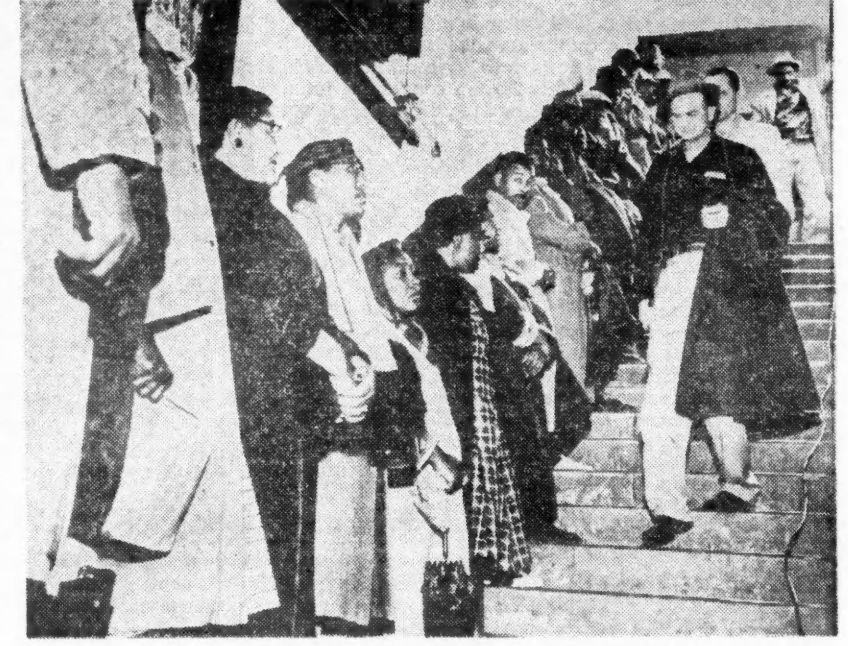
NEGROES LINE STAIRS TO REGISTER IN SOMERVILLE, TENN. Said one: "I'll go back again and again until I'm registered"

The McFerrin grocery store, owned by a Negro, is in danger of going out of business because soft drink distributors, baking companies and a gas company won't