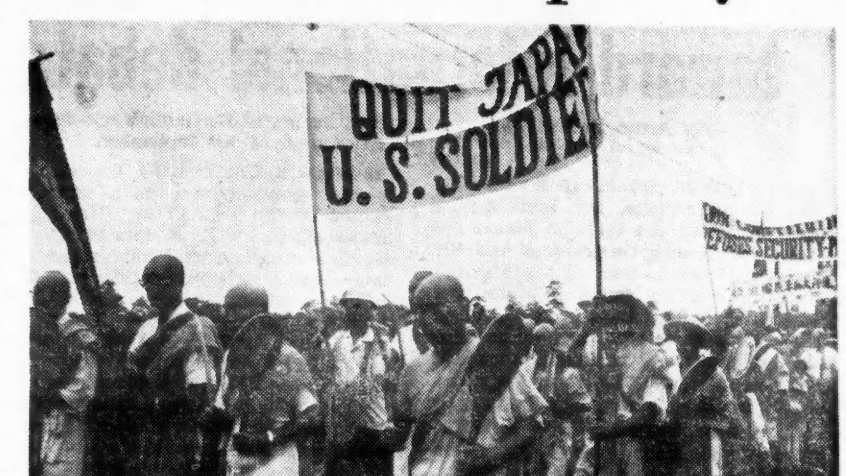
PEACE MARCHERS NEAR THE TACHIKAWA BASE IN A TOKYO SUBURB Their feelings were plainly displayed in the signs they carried

port of the conference as a whole, are now in the driver's seat. The "enemies of peace" have been labeled as such and specific measures for fighting these enemies have been enumerated in the Tokyo Appeal, the Resolutions and the Recommendations for International Common