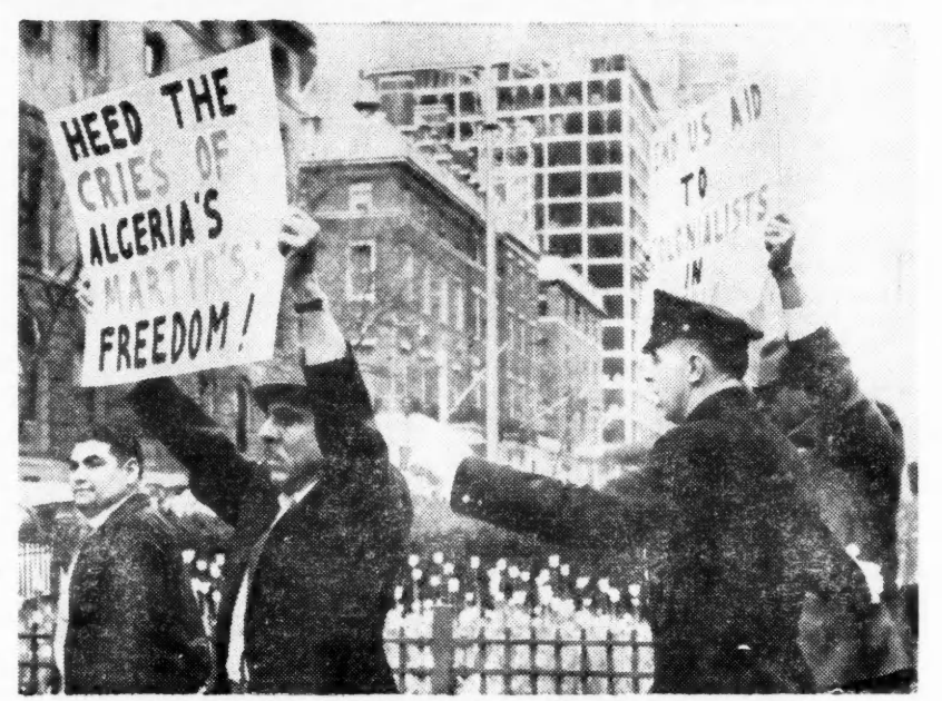
THE SCENE IS NEW YORK—THE SENTIMENT 1S CLEAR The cops broke up this protest when De Gaulle came last spring

CONGO EXAMPLE: The deterioration of East-West relations and the stiffening of Soviet foreign policy would normally tend to increase Western solidarity. But this is not the case in colonial problems. The Congo was a prime example. The desire to escape the colonialist label before world opinion will henceforth play a determining role in Western, and