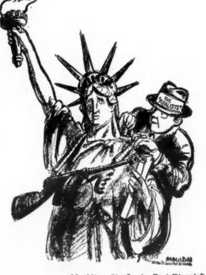
'It looks great on you, kid. Now why not drop that other junk?"

The New York Times (July 5) editorially attacked S-2652 as an "extremist measure that insults the intelligence of the American citizen and traveler" with the American citizen and traveler" with its "obnoxious . . , and ludicrous provi-sions." It is possible the Dodd-Keating bill will be allowed "to die quietly," as the Times suggests, if enough people write their Senators in opposition to this and other anti-civil liberties bills. Lacking such a popular expression, there is a real danger the bill may slip through in the last days of this Congress.