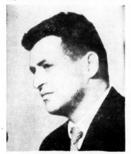
GARY FRANCIS POWERS Others were in the dock too

Some found a refreshing contrast be-tween the Powers case and previous So-viet trials. The Louisville Courier-Journal said: "It [the trial] has shown the world that the manners of Soviet justice have improved immeasurably since the ghastly